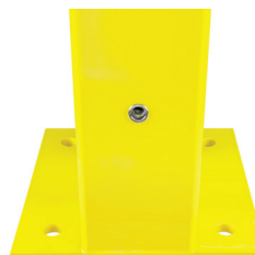
› Flush Post