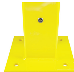
› Center Post