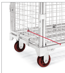
Quick clip design assembles without tools