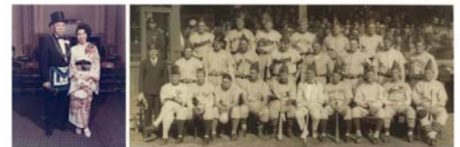
CARING FOR YOUR MASONIC TREASURES DOCUMENTS, PHOTOGRAPHS, AND BOOKS

We hope that the guidelines in Caring for Your Masonic Treasures will help you feel confident that you are doing what you can to help insure the long-term preservation of your lodge's or Valley's documents, photographs, and books.