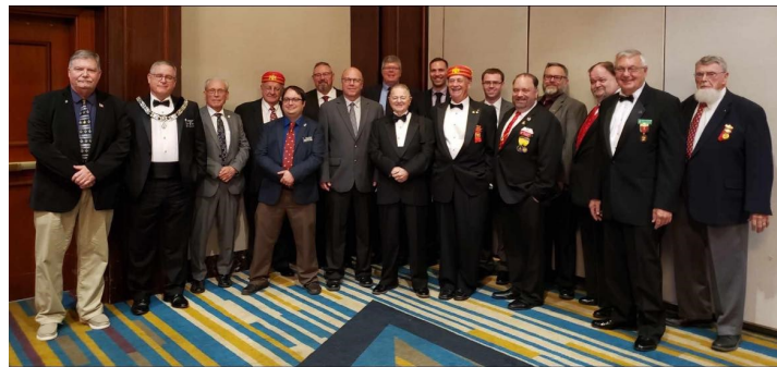
Valley of Danville Members at ICOD