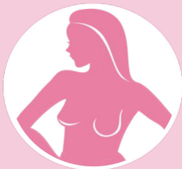
Clinical Breast Exam