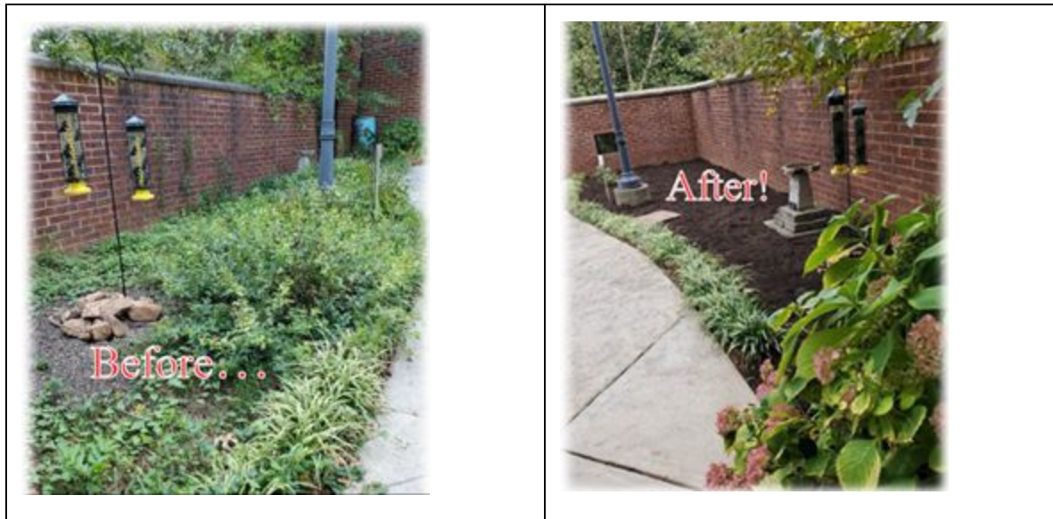
EEASC Mini-Grant Supports Sensory Garden at Anderson County Public Library

EEASC provided a $300 Mini-Grant to support the development of a sensory garden at the Anderson County Public Library in Belton, SC. Library staff and community volunteers, including Master Gardeners and Master Naturalists, are working together to create an aesthetically pleasing, therapeutically beneficial, environmentally friendly, and of course educationally enriching Sensory Garden that stimulates four of the five senses: sight, smell, sound, and touch. A colorful landscape of fragrant flowers, textured bark and rustling leaves will invite more melodious songbirds and beautiful pollinators to kindle the senses of all ages!