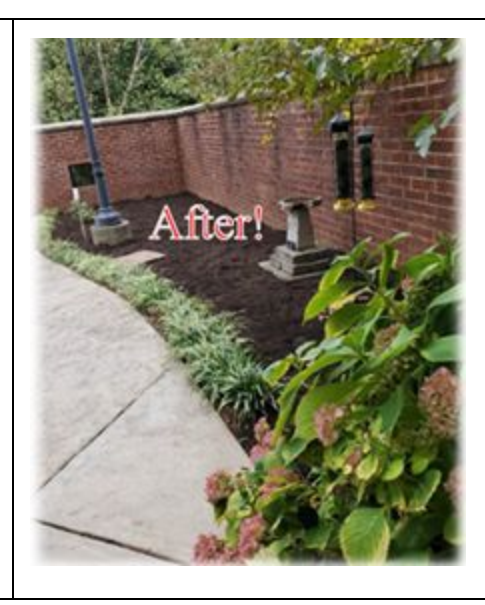
EEASC Mini-Grant Supports Sensory Garden at Anderson County Public Library

EEASC provided a $300 Mini-Grant to support the development of a sensory garden at the Anderson County Public Library in Belton, SC. Library staff and community volunteers, including Master Gardeners and Master Naturalists, are working together to create an aesthetically pleasing, therapeutically beneficial, environmentally friendly, and of course educationally enriching Sensory Garden that stimulates four of the five senses: sight, smell, sound, and touch. A colorful landscape of fragrant flowers, textured bark and rustling leaves will invite more melodious songbirds and beautiful pollinators to kindle the senses of all ages!