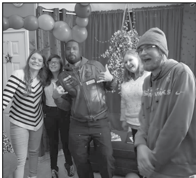
EPCC Christmas Fun.