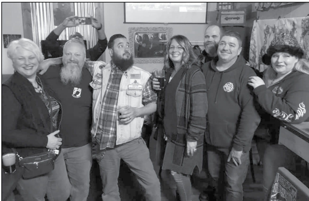
Star Lake crew at the Rail Hop'n Brewery Night event Dec 21st.

As always remember that the road may be the same, but the journey is always different. Be prepared and be safe out there. See you down the road. ◇