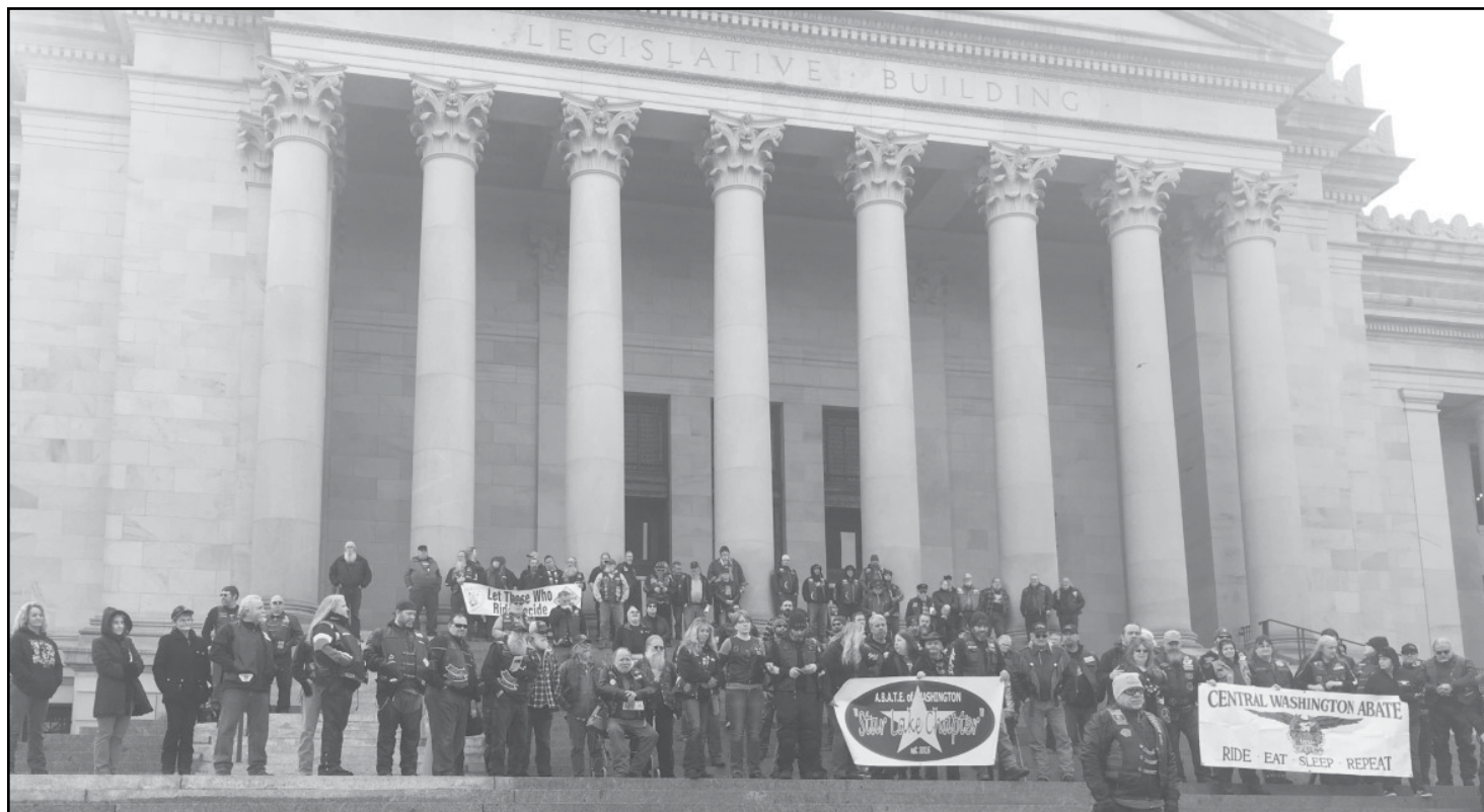
ABATE of Washington on the Capitol Steps.