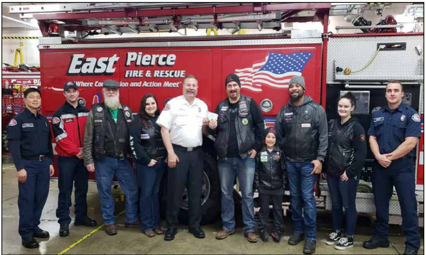
EPCC Presents TBR 2019 Check to East Pierce Fire & Rescue.