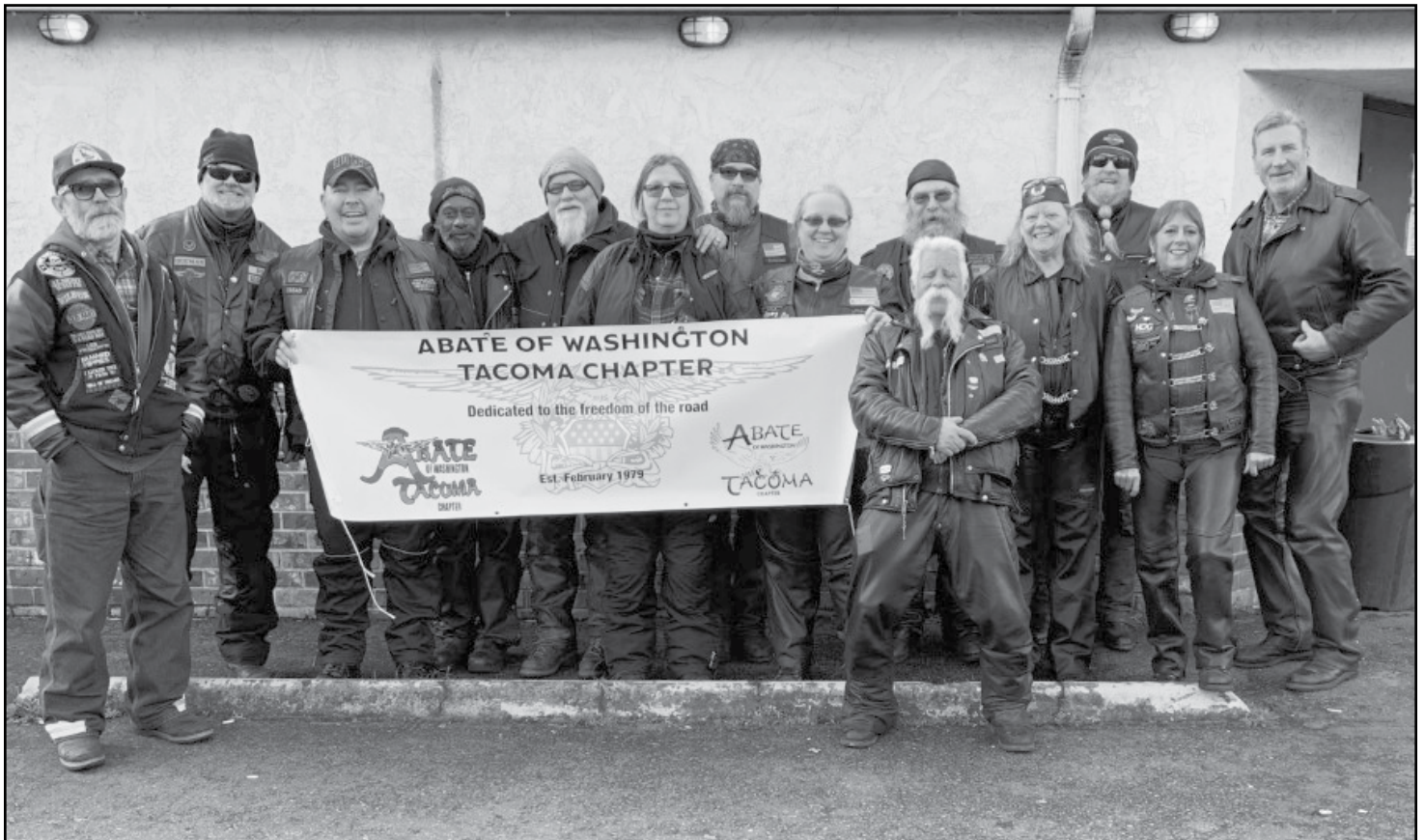
Tacoma chapter at the start the year off right ride. January 1st.

"Keep the throttle twisted and the rubber side down" ♦