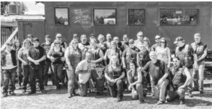
"Run for the Hills" Star Lake Chapter event

We just had our first official ride as a Chapter with a good turn out and support by a couple of our chapter sisters, Tacoma and SKCC. Thanks for sharing the day and a lots of laughs! Everyone worked hard and you could tell from the results...a good day and we have a little money in the bank!