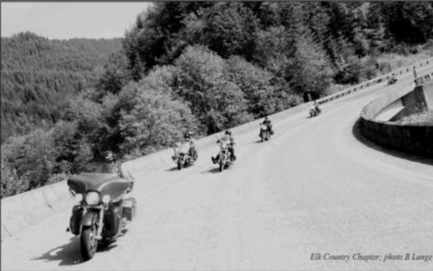
Elk Country Chapter; photo B Lange