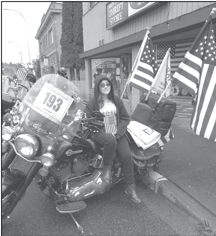
At the Veterans Day Parade in Auburn.

I as well as a lot of you don't put my bike away this time of year due to the weather. If you are like me and are still riding and will continue then ride safe friends and we'll see you on out there on the road. Stay cool! ◇