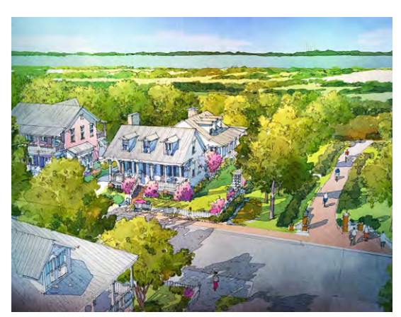
View of the Mississippi from Pecan Grove Bluff Neighborhood