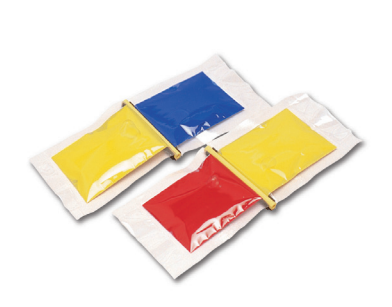
Hinge-paks for 2-part adhesives/encapsulants