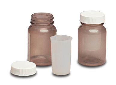
Insert kits for multi-component coatings