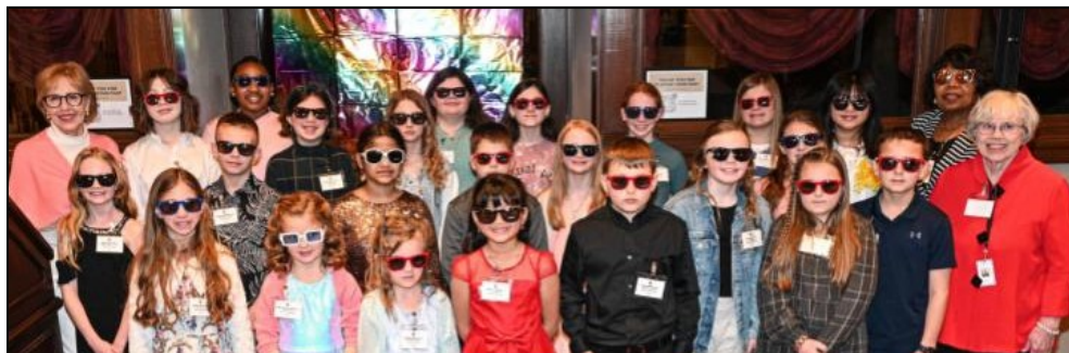
24 of the 36 Symphony in Color Gold Ribbon winners