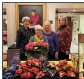
Volunteers at the Side-by-Side lunch

March 19 in the lobby of the HCT. Our ISOA provided hearty Subway lunch boxes including a six-inch sub, chips, and chocolate chip cookie, and additional chips, water, and cupcakes from Nothing-Bundt-Cakes. The ISO Musicians Union joined in with a donation toward the purchase of the cupcakes. The musicians were most grateful and returned to their second rehearsal with renewed energy. Many ISOA members added their enthusiasm to the thrilled audience attending this concert. From prize donors to student guides to concert ushers and, of course, cheering fans, ISOA was well represented. Well done, all!