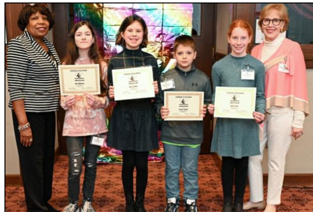
Four more students judged as Top Eight winners