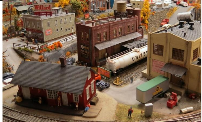
Industrial operations in Mohawk.