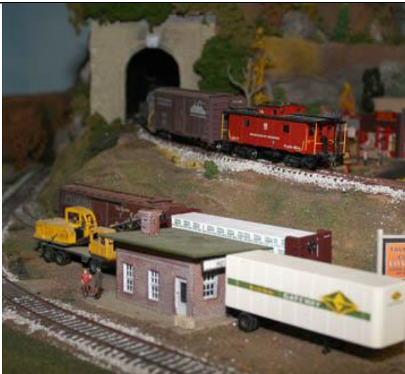
Westfield freight station being unloaded