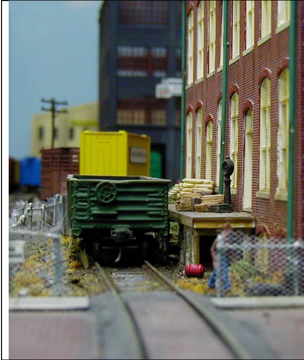
Looking west toward the Bear thread company. In Northport