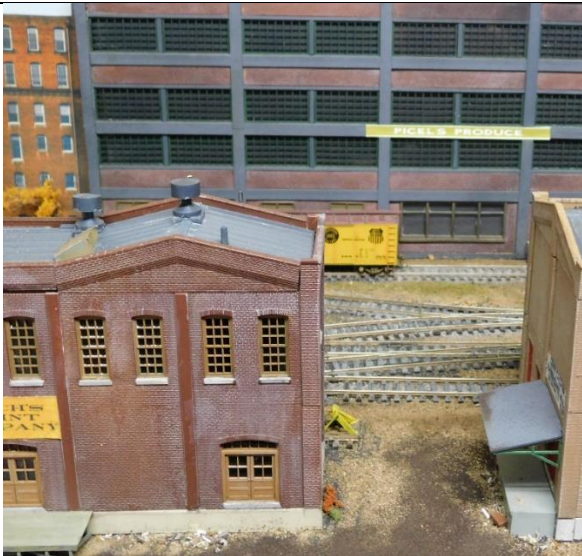
Fuchs Paint Company in Salem