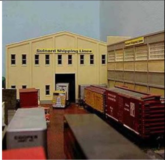
Guinard Shipping looking at warehouses with docks on the other side, out of view.