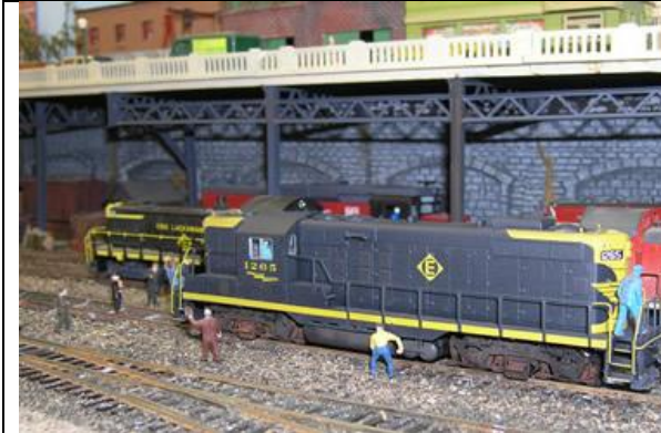
Engine layover in Kensington. A re letters Erie