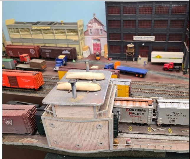
Ferryboat Sultana being loaded