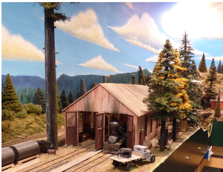
Above: Two stall engine house on Tom O'Connor's Central Grove Lumber layout

Both of these layouts featured terrific backdrops that blended very well with the foreground scenes. There were many other great layouts that I saw, but space is limited.