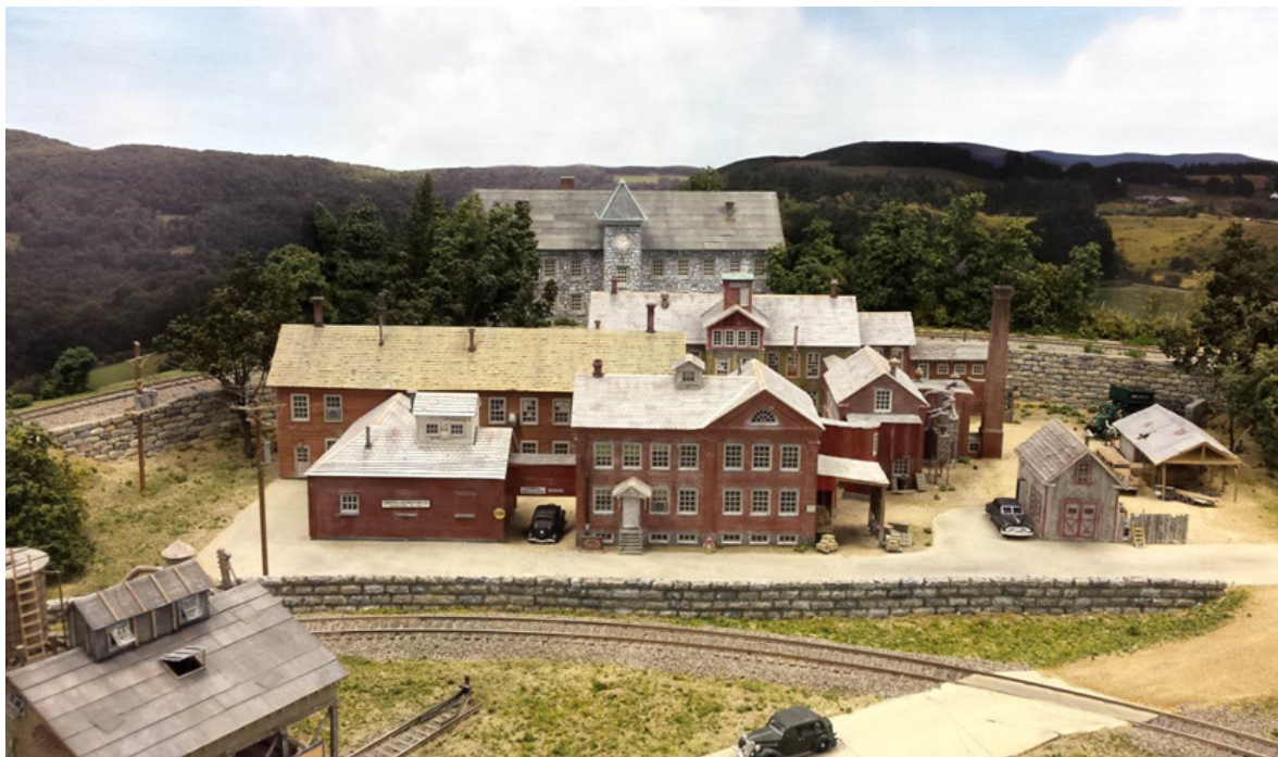
Right: Some mills on Marshall Sommer's Rhode Haven Layout