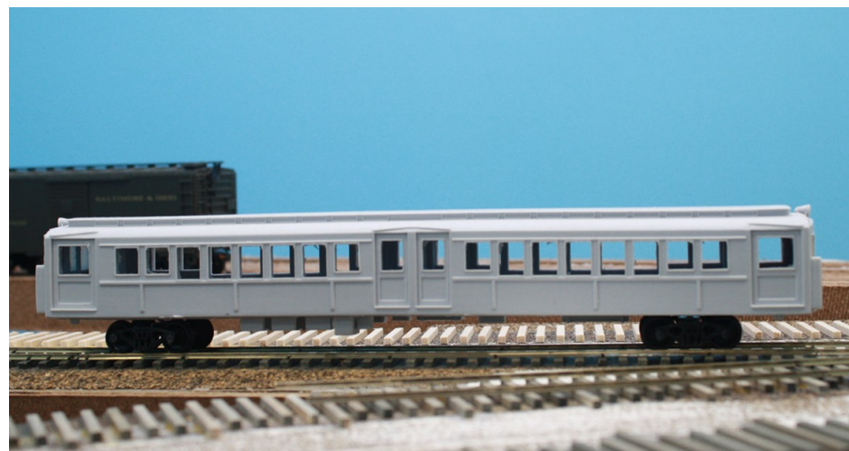
A SIRT multiple unit car is under construction on Ciro Compagno's Richmond Harbor. Note the extended ties for the future third rail.