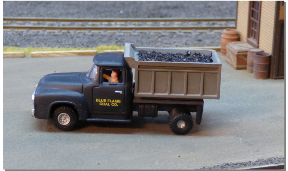
The completed "scissors" coal truck is shown above.

Another offering from Life-Like is a 'scissors' coal truck. The dump body is a bright red that screams 'plastic' and the scissors mechanism to dump the coal is not prototypical. So, I removed the scissors mechanism and glued two pieces of .100" styrene channel stock length-wise on top of the truck's under frame. I then painted the dump body a more realistic blue/grey and added a coal load.