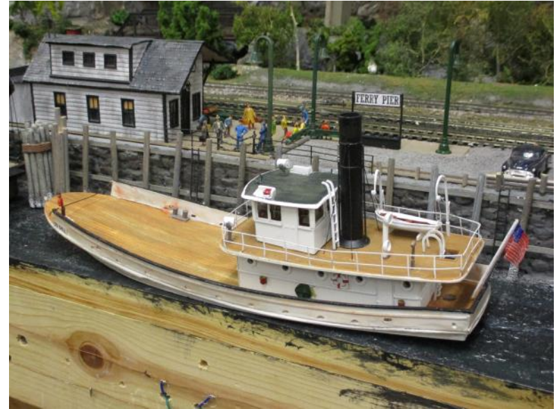
Above and Left: Views of an expanded waterfront scene on Fred Dellaiacono's layout.

The car ferry is a Seaport Model Works resin kit. The hull and bulwarks are resin, the deck house and pilot house are etched brass. Rattle can and brush painted. It is rather unique in that cars are only loaded from the bow. There is a prototype for this vessel and further research revealed that they are not as uncommon as one might think especially in Europe. WP