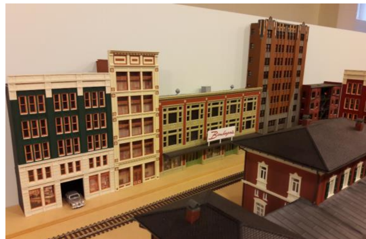
Above: When you have a little time, you assemble a building. When you have lots of time to stay home and be safe, you build a city. That's what Kai is doing, using his time to build a city.

This is just a sample of some of the model railroading activities during the COVID-19 pandemic and I am sure that many other members of the Garden State Division have some great stories of their own. As we do our best to be good citizens, we are probably becoming better modelers. WP