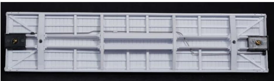
Left: Chuck Diljak has been doing his part to "flatten the curve" by scratch building a flatcar. This progress photo shows the underside nearly complete. Only brake components and a few frame pieces need to be added.