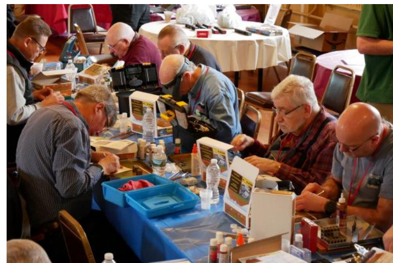
Right: Members of the Garden State Division are hard at work building the Skip's Bait & Tackle kit. Assembling and finishing craftsman structures is a rewarding experience.