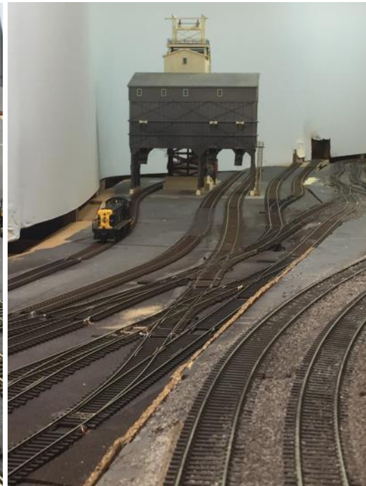
Above: These two photos show opposite ends of a mine scene on Joe Valentine's layout. Joe finished gluing the track and he carefully tested the switches and track and all works well. Now he is on to the next project.