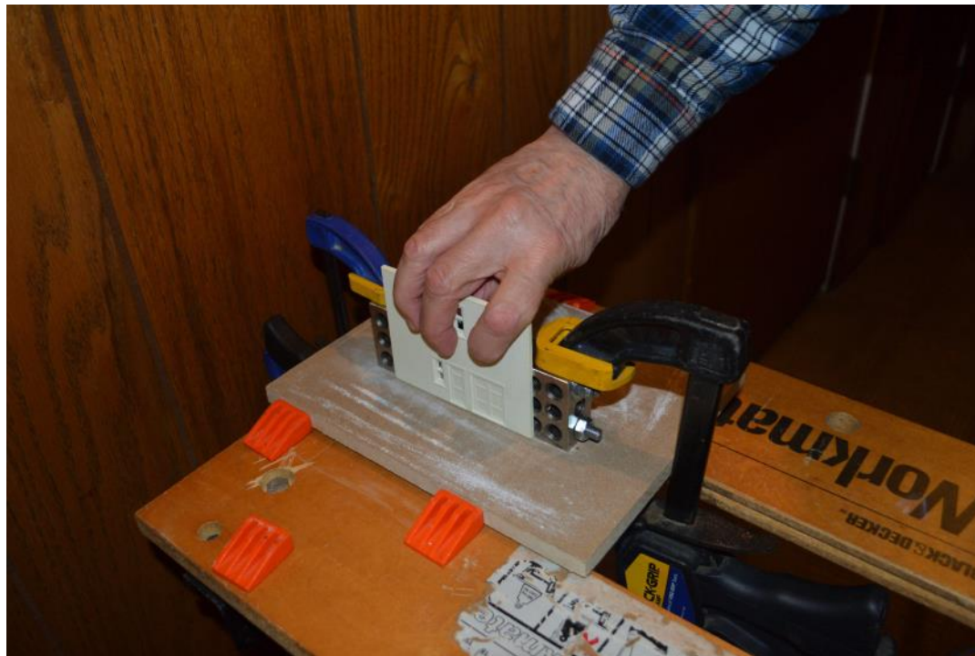
Above: Jim uses this assembly to remove the draft angle from walls of DPM plastic kits. Using two steel 123 blocks provides a longer guide for the sanding operation. The holes are used to align and join the blocks with a long bolt or threaded rod passing through the holes.

Now that we have safe habits for washing our hands, lets not forget to wash our plastic, resin and metal parts. Also remember some other advice: To be safe, stay inside and build models. WP