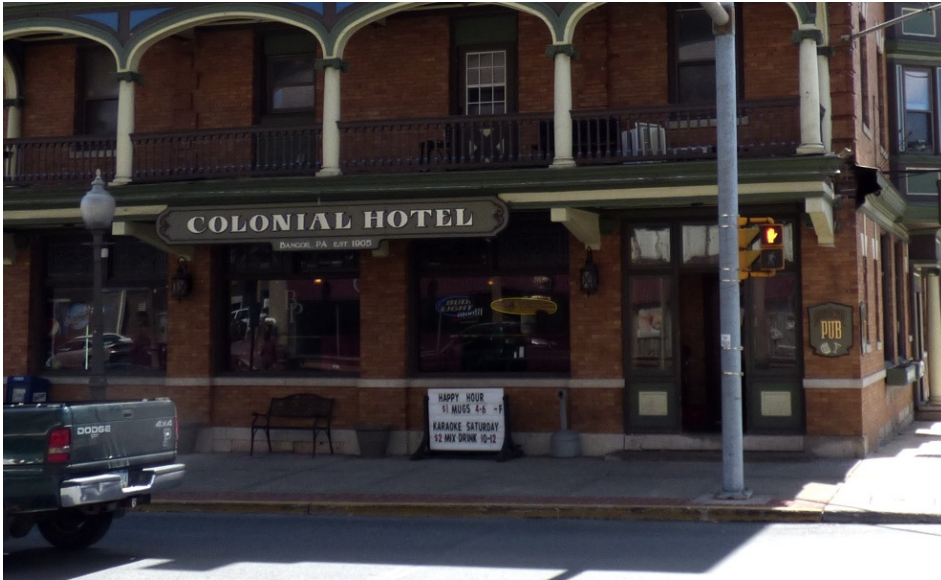
Above: A photo of our meeting location, the Broadway Pub in the Colonial Hotel.