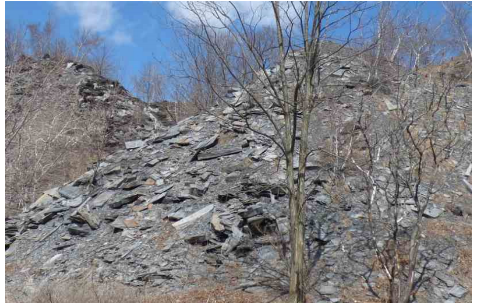
Above: One of the many slate slag heaps in the Bangor, PA area.

While driving around the Slate Belt, take notice of all the slate roofs that you will see along the way, and don't miss the huge piles of slate debris that you will find along the road. It will be a good time to stop and pick up some slate to use as scenic material on your layout or dioramas!