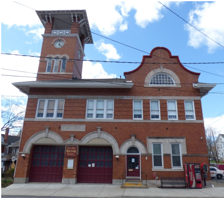
Above: The Slate Belt Heritage Center

While driving around the Slate Belt, take notice of all the slate roofs that you will see along the way, and don't miss the huge piles of slate debris that you will find along the road. It will be a good time to stop and pick up some slate to use as scenic material on your layout or dioramas!