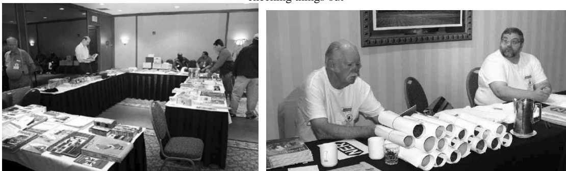
Our Pre-Auction display setup