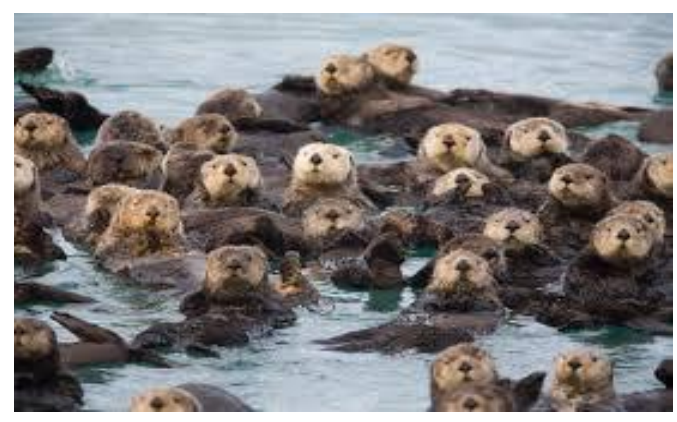
Sea Otter (Enhydra lustris)

The River Otter lives throughout Florida and should not be confused with the Sea Otter of the eastern and western coastal waters of the north Pacific Ocean. River otters are a common mammal resident of the inland freshwaters and in the coastal bays of south Florida and are frequently seen and encountered by people like yourself. If you have an