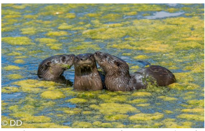
North American River Otter (Lontra canadensis)