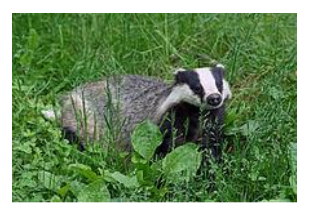
European Badger (Meles meles)

Range: "...originally occurred throughout Europe, including the British Isles and several Mediterranean islands (Sicily, Crete, Rhodes), and in Asia as far east as Japan and as far south as Palestine, Iran, Tibet, and southern China." (Nowak, 2005)