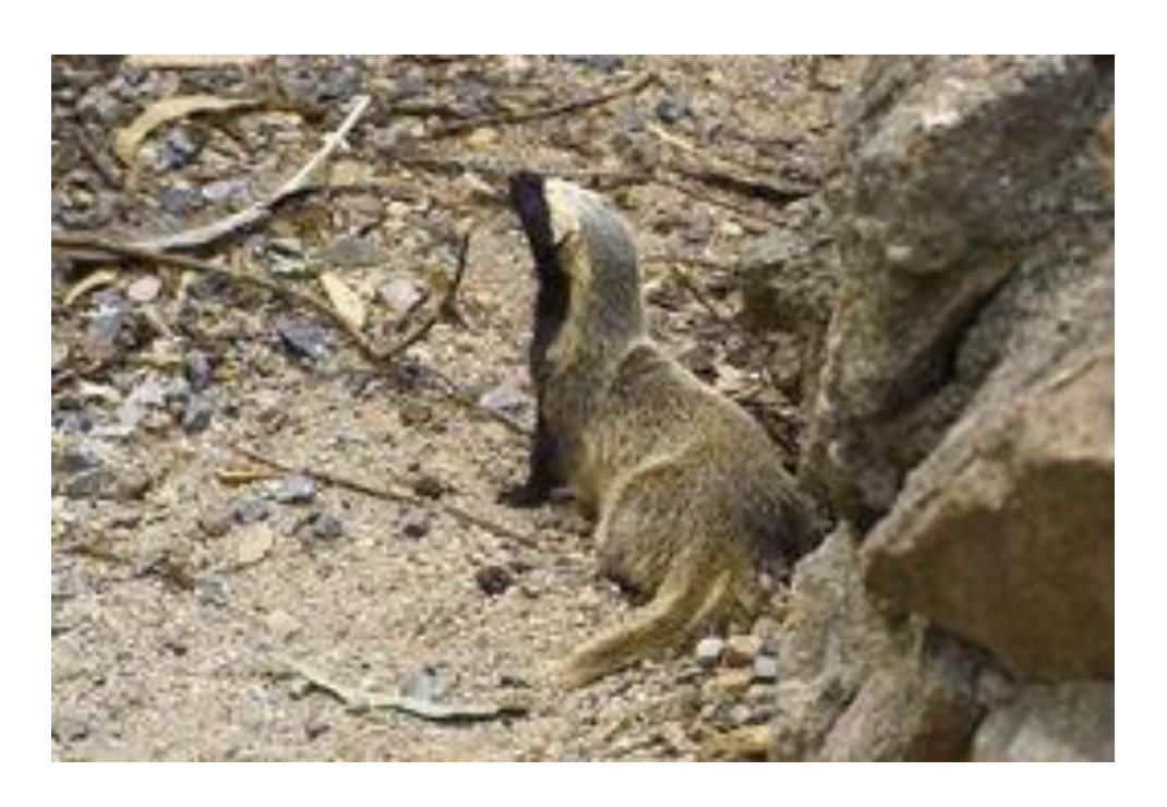
Lesser Grison (Gallictis cuja)

Range: The Lesser Grison ranges through central and southern South America