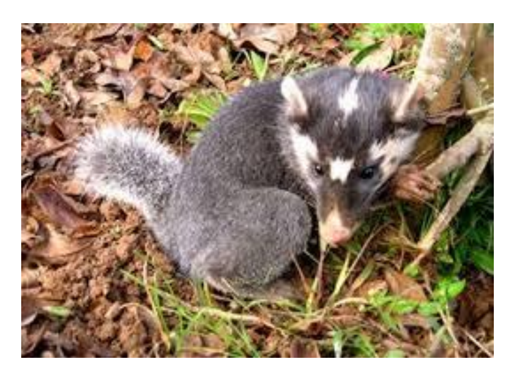
Javan Ferret-badger (Melogale orientalis)

Special Note : "Physically indistinguishable from Bornean Ferret Badger and sometimes considered the same species (and both are sometimes treated as a subspecies of Large-toothed Ferret-badger)." (Hunter, 2011).