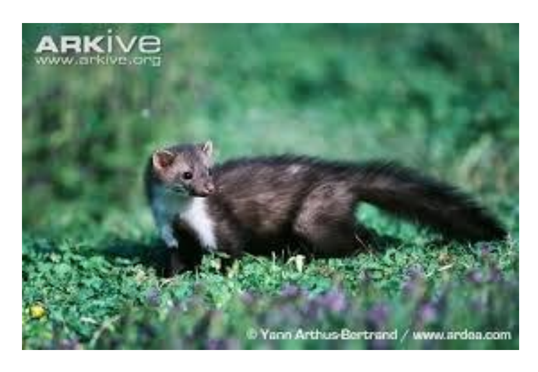
Stone or Beach Marten (Martes foina)

Range: "...occurs through much of Europe and central Asia south-east to northern Myanmar. It is found from Spain and Portugal in the west, through central and southern Europe, the Middle East (southwest to Israel), and central Asia, extending as far east as the Tuva (Russia) and Tien Shan mountains and north-west China." (IUCN)