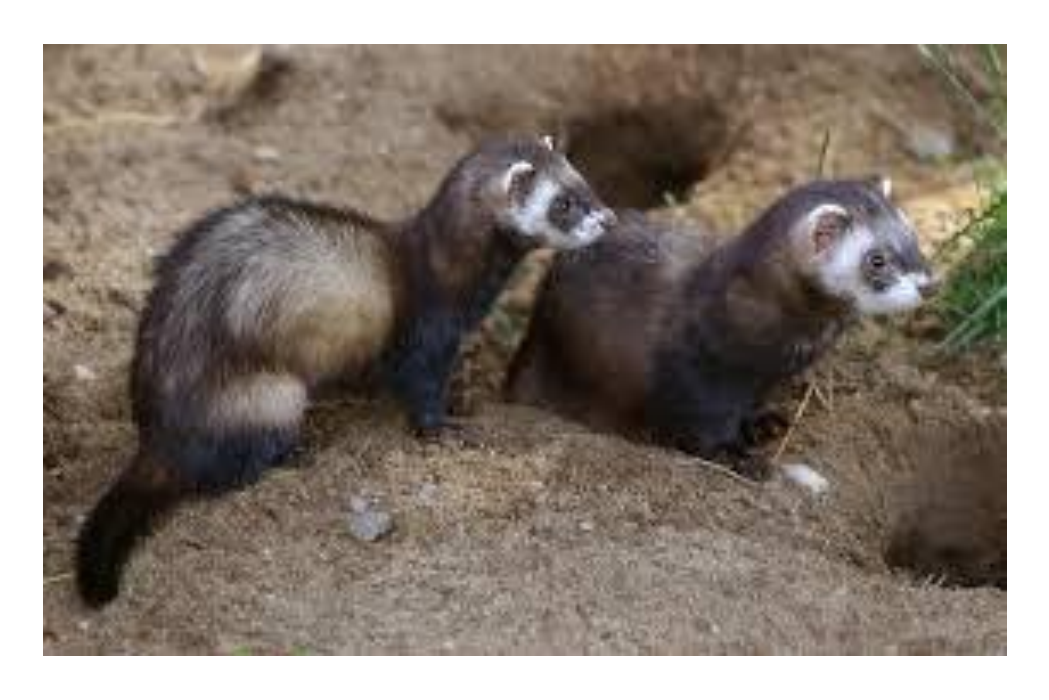
European or Western Polecat (Mustela putorius)

Range: widespread in the western Europe and "... east to the Ural Mountains in the Russian Federation. it is absent from Ireland, northern Scandinavia, much of the Balkans, much of the eastern Adriatic coast, and occurs in Greece only marginally, in the north. It is widespread in France, less so in the south-west and south-east in mainland Spain, in Romania and in many other countries of its range. Since the year 2000 many distribution gaps in the Swiss Midlands and Jura have been filled and in the Grisons the species has expanded its range in the Vorderrhein Valley to almost the Oberalp Pass, and in the Vorderrhein Valley to the Via Mala area." (IUCN)