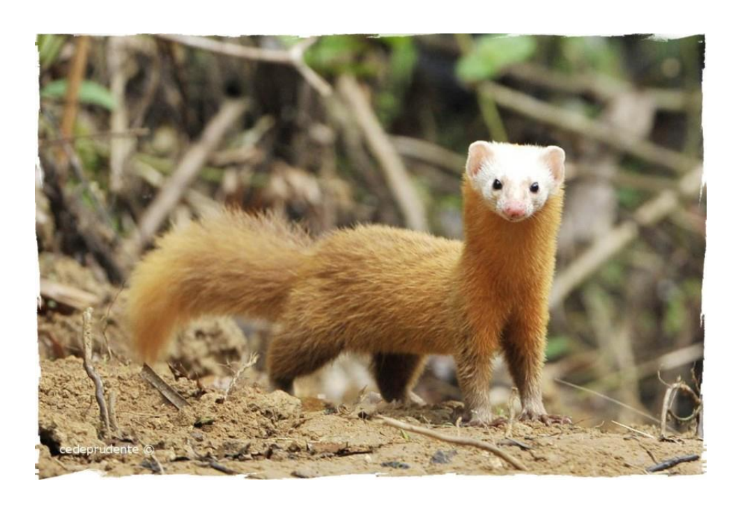
Malayan Weasel (Mustela nudipes)

Range: Thai-Malay peninsula, and the islands of Sumatra and Borneo (IUCN)