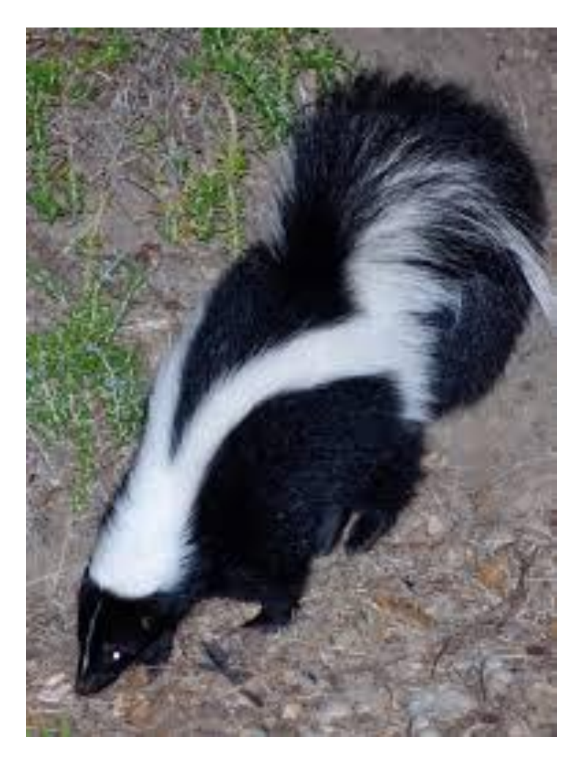
Striped Skunk (Mephitis mephitis)

Range : "The species occurs throughout most of southern Canada from British Columbia, Hudson Bay, and Nova Scotia, throughout the United States and into northern Mexico." (IUCN)