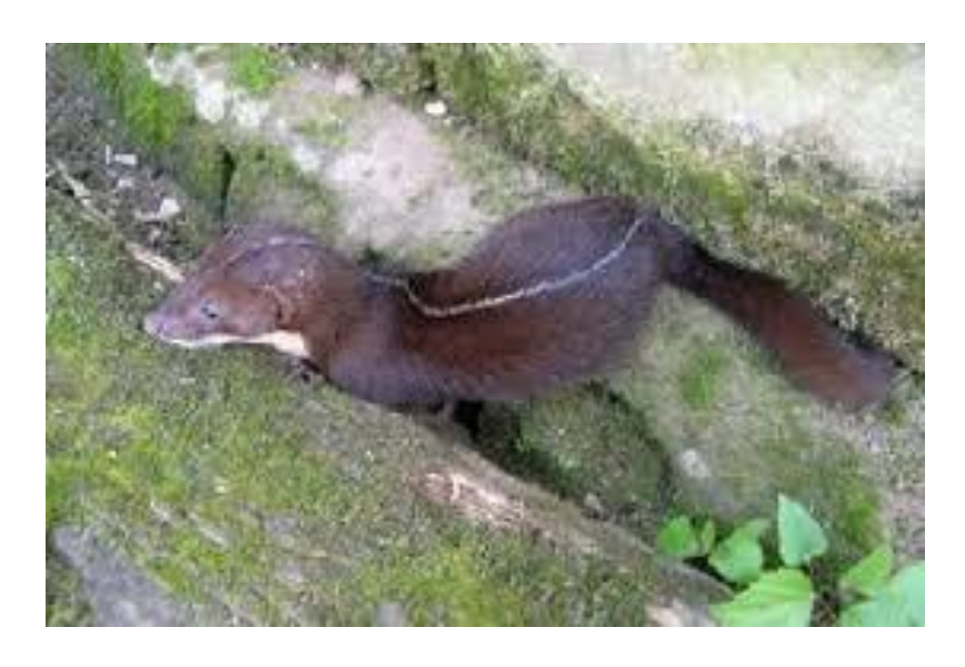
Back-striped Weasel (Mustela strigidorsa)