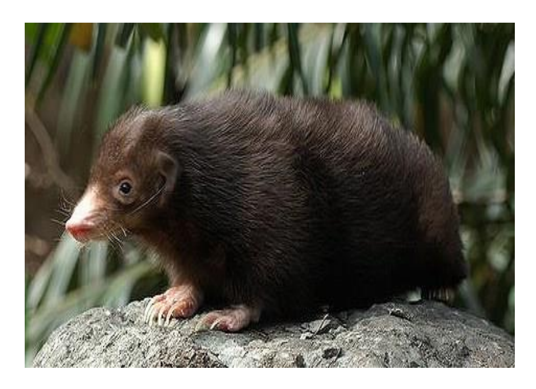
Palawan Stink Badger (Mydaus marchei)

Range: Palawan and Calamian Islands of the Philippines. (Novak, 2011)