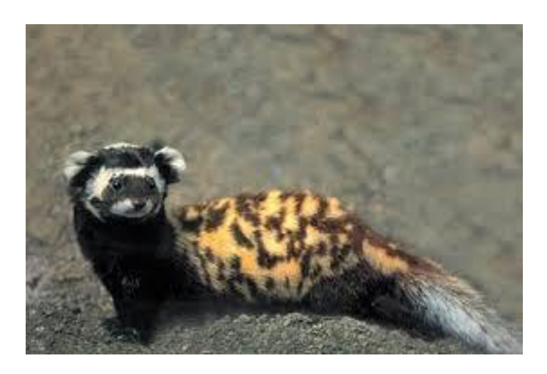
Marbled Polecat (Vormela peregusna)

Range: "N. China, Mongolia, C. Asia, the Middle East and SE Europe." (Hunter, 2011)