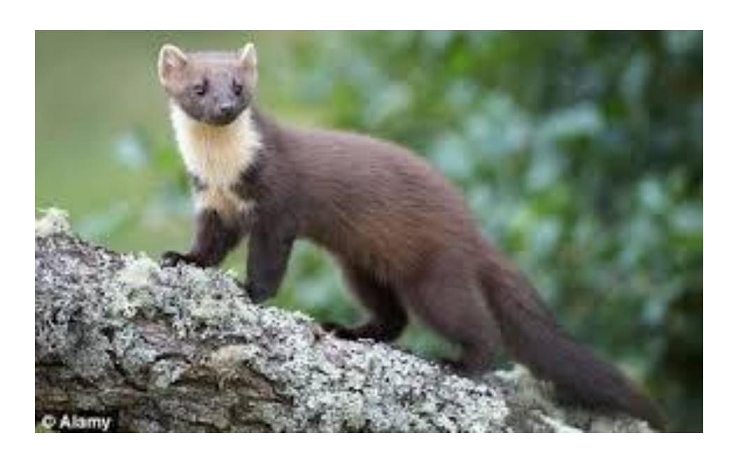
European Pine Marten (Martes martes)

Range: "...throughout most of Europe, Asia Minor, northern Iraq and Iran, the Caucasus, and in westernmost parts of Asian Russia (Western Siberia)." (IUCN)