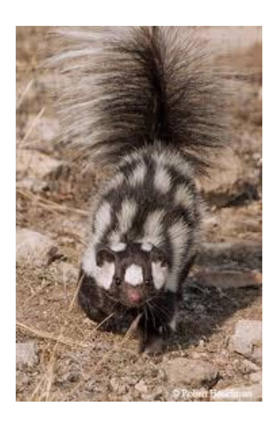
Western Spotted Skunk (Spilogale gracilis)

Range : This spotted skunk can be found from extreme southwest British Columbia and south along the Pacific Coast states into and across Mexico and Central America to El Salvador