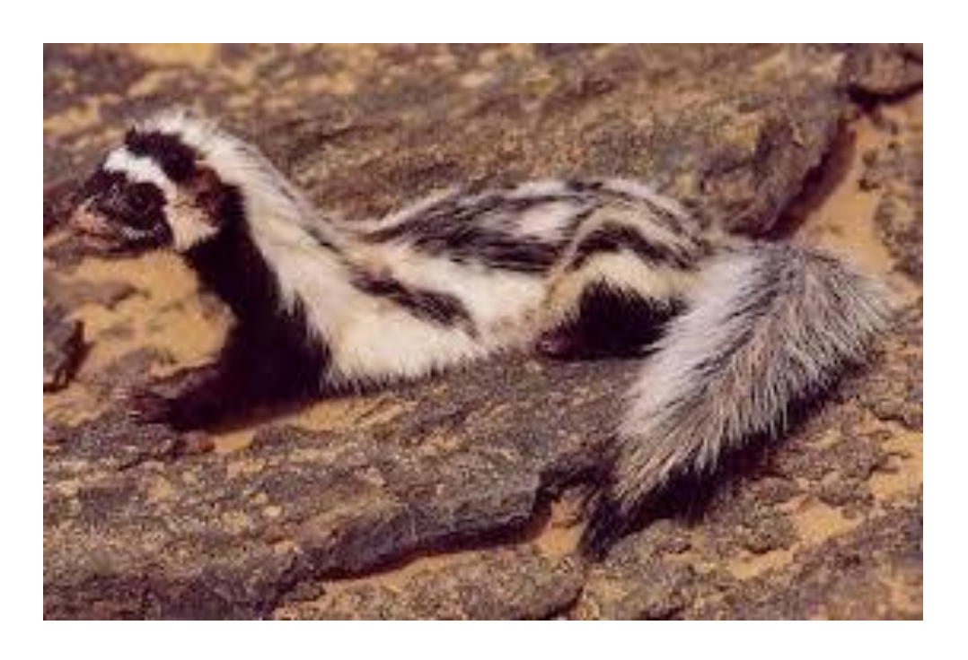
Libyan Weasel (Ictonyx libyca)