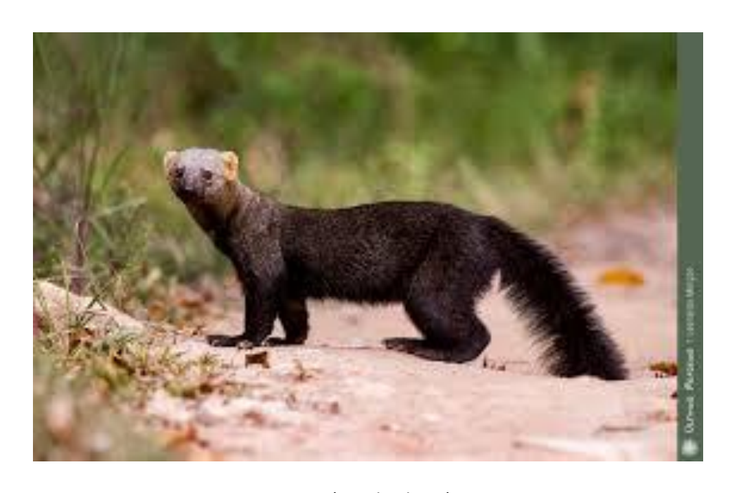
Tyra (Eira barbara)

Range : From southwestern and southeastern Mexico south through Central American and into South America