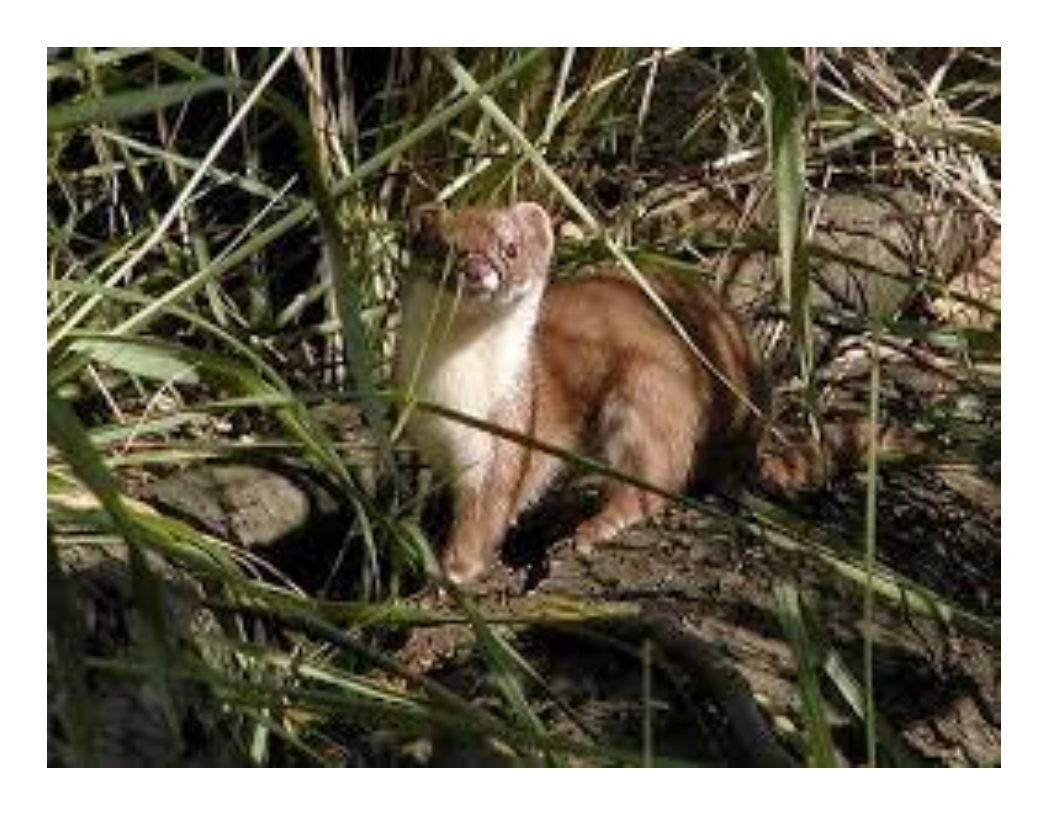
Columbian Weasel (Mustela felipei)

Size : 328-352mm x 120-150g (Hunter, 2011)