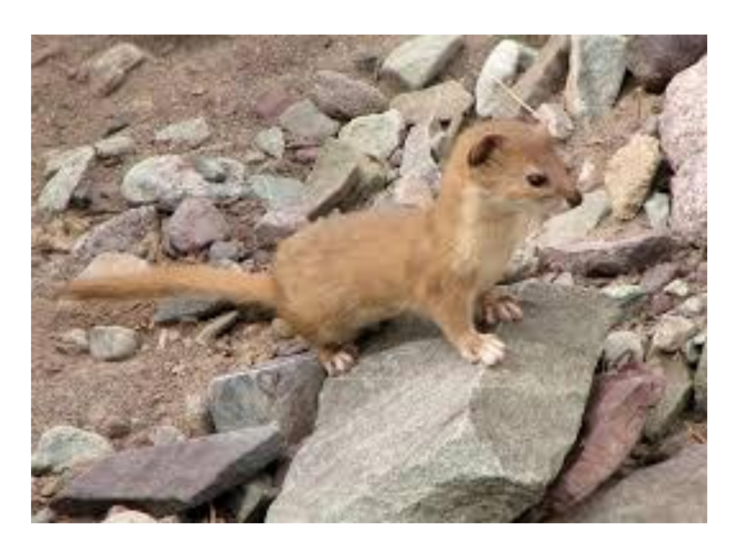
Altai or Mountain Weasel (Mustela altaica)

Range: Numerous countries of central and eastern Asia