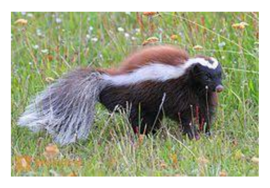
Amazonian or Striped Hog-nosed Skunk (Conepatus semistriatus)

Range: "Its range begins in southern Mexico and continues south into northern Peru along the western Andes and east across northern Venezuela and into the Ilanos of Colombia, with an isolated population in eastern Brazil (Nowak 2005)." (IUCN)