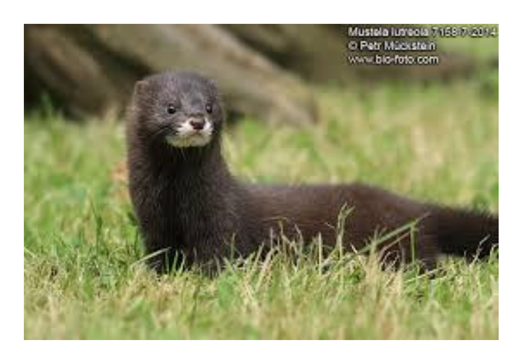
European Mink (Mustela lutreola)

Range: "France; Romania; Russian Federation; Spain; Ukraine" (IUCN)