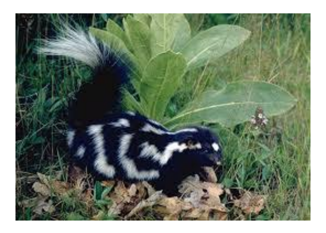
Southern Spotted Skunk (Spilogale angustifrons)

Range: This species occurs through central Mexico southward into Costa Rica