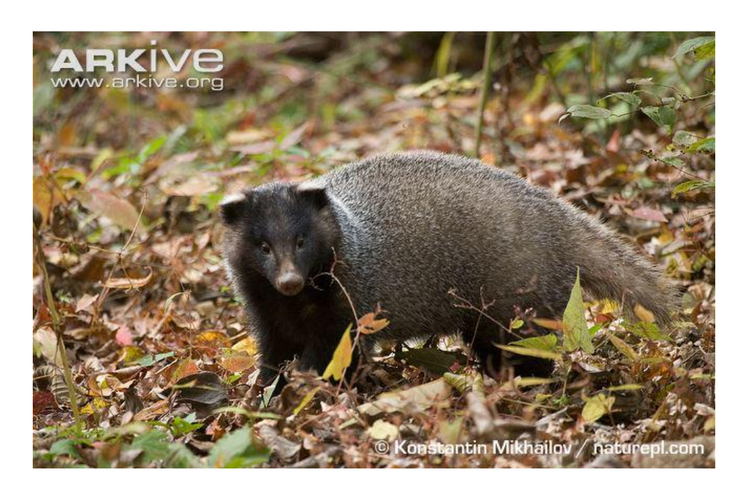
Asian Badger (Meles leucurus)

Range: The "Asian Badger is found in Russia (from the Volga River east through parts of Siberia to the Russian Far East) and across central Asia east of the Caspian Sea to Mongolia, China and Korea." (IUCN)