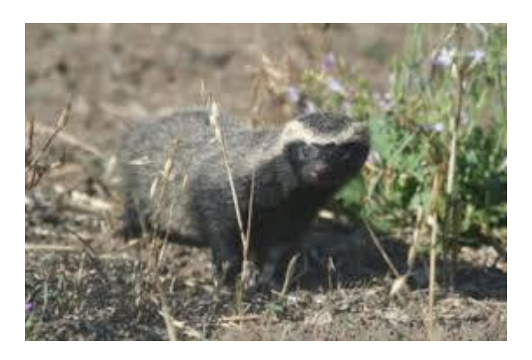
Patagonian Weasel (Lyncodon patagonicus)

Range: South and western areas of Argentina and Chile Size: 360-440mm (Hunter, 2011) x (weight unknown)