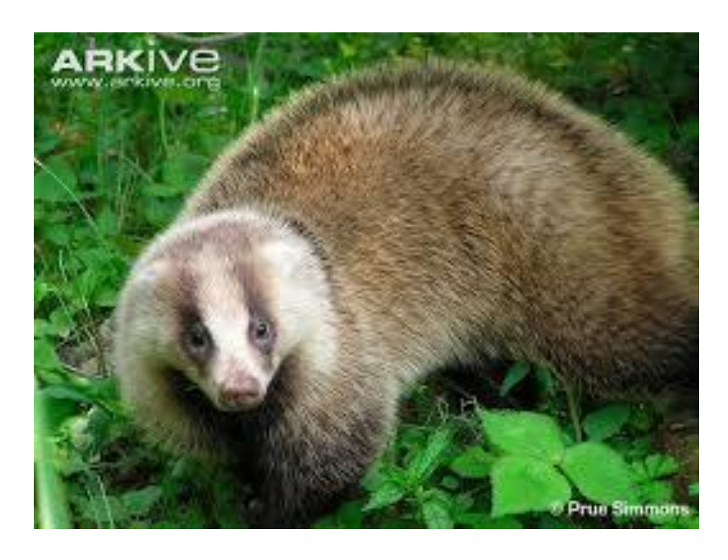
Japanese Badger (Meles anakuma)

Range: Only occurs on the Japanese islands of Honshu, Kyushu, Shikoku, and Shodoshima. (IUCN)