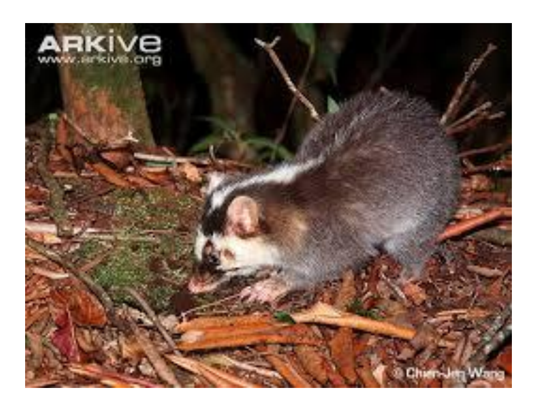
Bornean Ferret-badger (Melogale everetti)

Range: "Endemic to Borneo." (Hunter, 2011) Size : 475-660mm x 1500-3000g (Hunter, 2011)