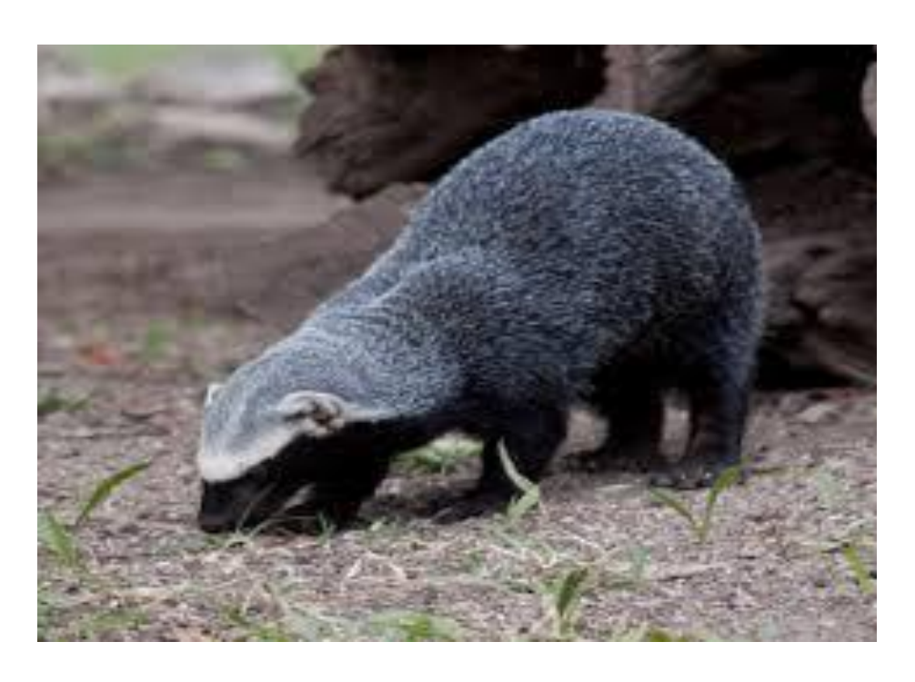
Greater Grison (Gallictis vittata)

Range: Southern Mexico south to Peru and Brazil Size: 635 -710mm and 1300-3200 g (Walker, 1975) Red List Status: LC A Species of Least Concern