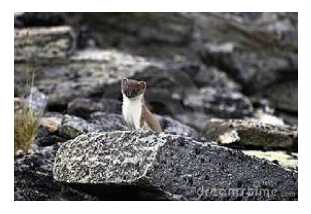
Least Weasel (Mustela nivalis)

Range: The Least Weasel has a circumboreal Holarctic distribution, taking in much of Europe, northern Asia and northern North America. It is found almost throughout Europe, including Britain (but not Ireland). In mainland Asia it ranges south to northern Mongolia and Korea and northern China. Further west in Asia it occurs south to Lebanon, Iran and Afghanistan. It is also found on Honshu, Hokkaido, Kunashiri and Etorofu islands in Japan and on Sakhalin and the Kuril islands in Russia. In North Africa it is confined to Morocco, Algeria and Tunisia. (IUCN)