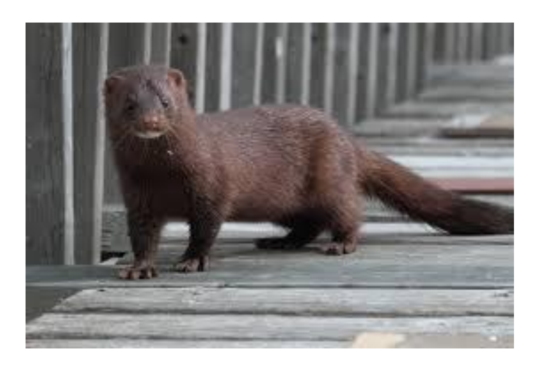
American Mink (Neovison vison)

Range : "The species occurs in North America from Alaska and Canada through the United States except Arizona and the dry parts of California, Nevada, Utah, New Mexico, and western Texas." (IUCN)