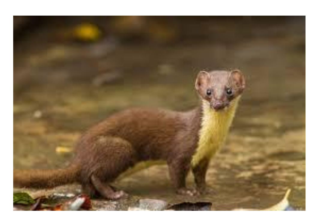
Yellow-bellied Weasel (Mustela kathiah)