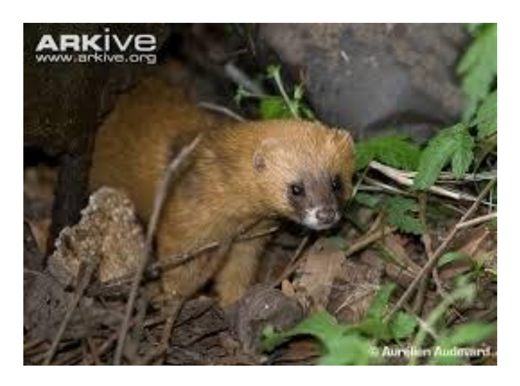
Siberian Weasel (Mustela sibirica)

Range: This species is distributed from the western Ural Mountains east to the Pacific Ocean and south to the islands of Taiwan and Jeju (Republic of Korea). It also occurs south of the Himalayas and a large part of east-central Asia (north, west, and southern China and southern Mongolia). (IUCN)