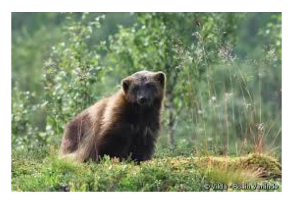
Eurasian Wolverine (Gulo gulo)

Range : Circumpolar from Norway to eastern Russia Size : 820-1319mm x 6600-18200g (Hunter, 2011)