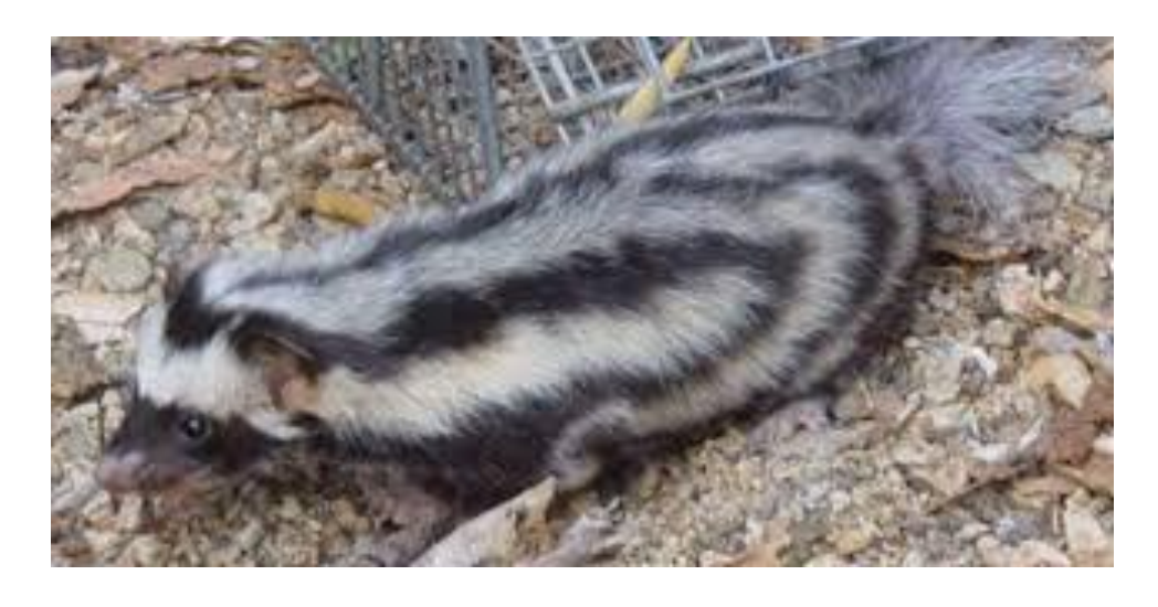
Pygmy Spotted Skunk (Spilogale pygmaea)

Range : Mexico's tropical Pacific coast from southern Sinaloa to Oaxaca. (IUCN, 2017) and (Nowak, R. M, 2005)