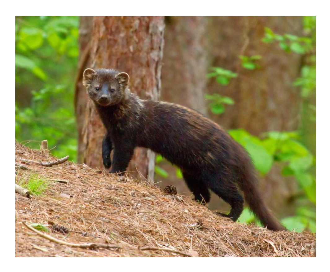
Fisher (Pekania [Martes] pennati)

Range : The "Fisher has a large range in northern North America: from Quebec, the Maritime Provinces, and New England west across boreal Canada to south-eastern Alaska, south through the western mountains to Utah, Wyoming, Idaho, and California, and formerly south to Illinois, Indiana, Tennessee, and North Carolina," (IUCN)