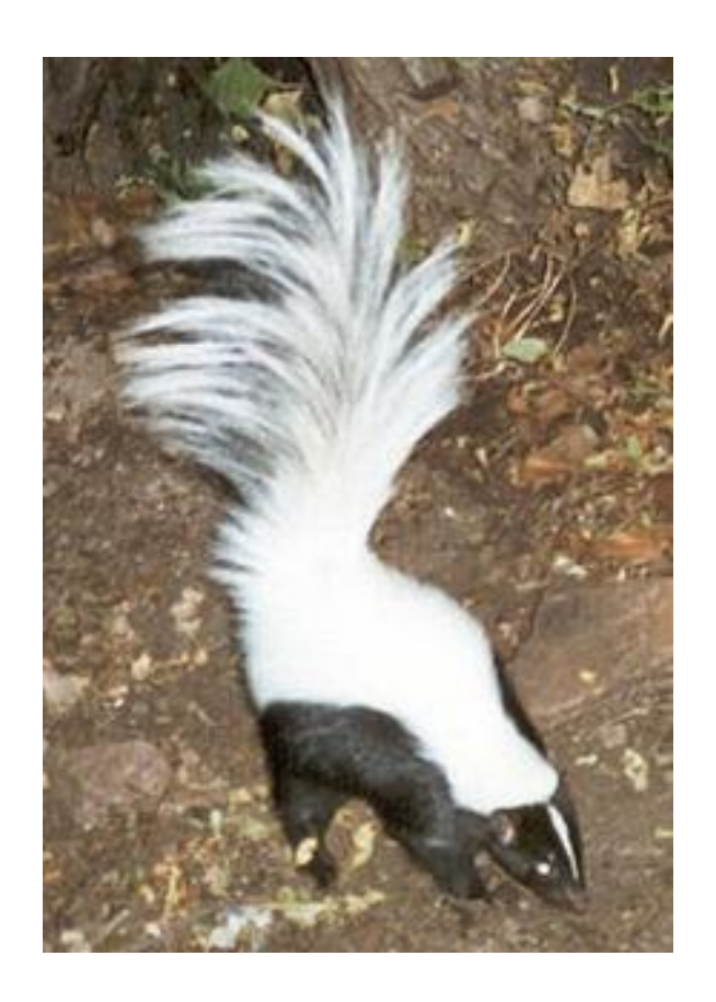
Hooded Skunk (Mephitis macroura)

Range : primarily in southwest U.S. in extreme west Texas, southwest New Mexico, and most of southern Arizona and Mexico thru to NW Costa Rica