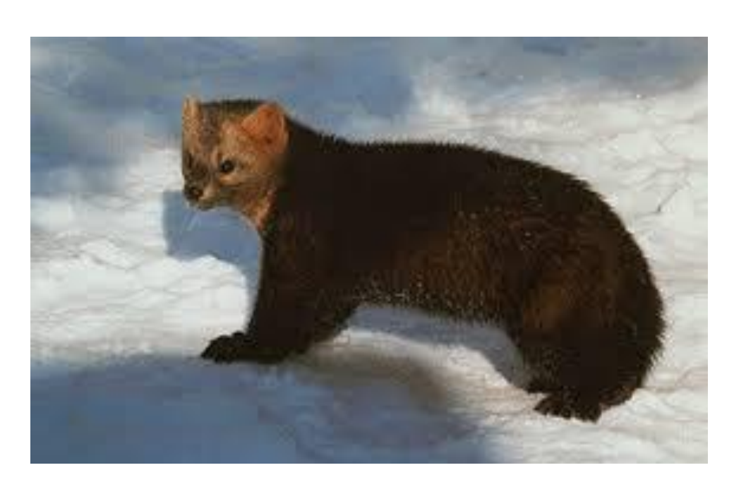
Sable (Martes zibellina)

Range: China; Japan (Hokkaido); Kazakhstan; Democratic People's Republic of Korea; Mongolia;