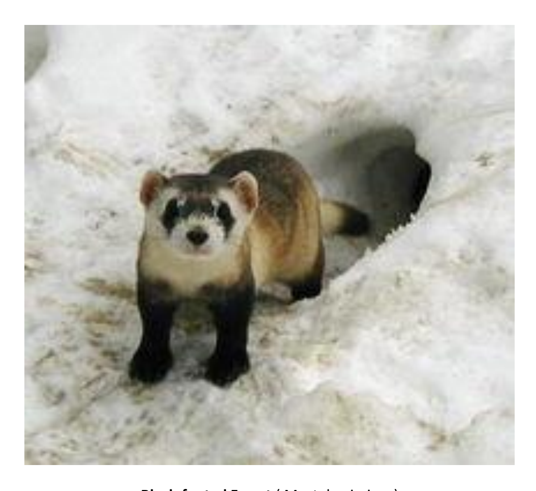
Black-footed Ferret ( Mustela nigripes)

Range: Very limited and disconnected populations in Arizona, Colorado, Kansas, Montana, New