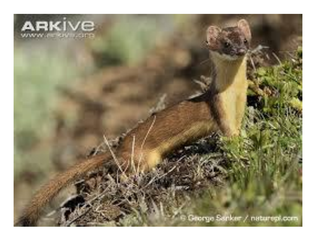
Long-tailed Weasel (Mustela frenata)

Range : "...from just north of the United States—Canadian border south to northern South America ...In South America it is known from Columbia, Venezuela, Ecuador, Peru, and Bolivia..." (IUCN)