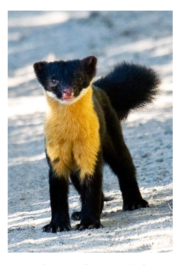
Nilgiri Marten (Martes gwatkinii)