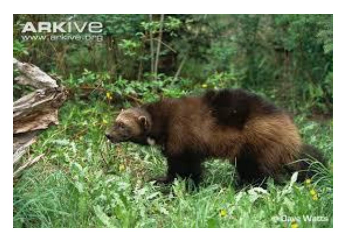
North American Wolverine (Gulo luscus)

Range : Alaska down to British Columbia and through northern Canada and into Newfoundland Size : 910-1040mm x and 17,000-27,000g. (Burt and Grossenheider, 1966)