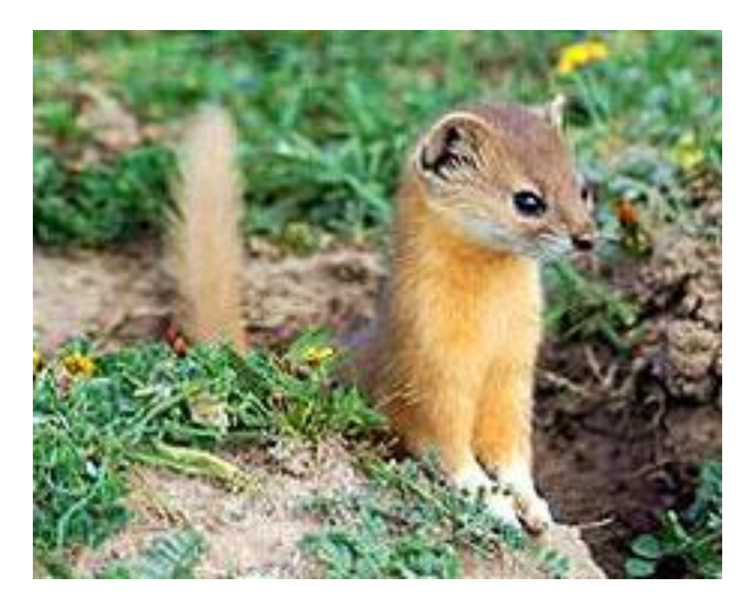
Indonesian Mountain Weasel (Mustela lutreolina)