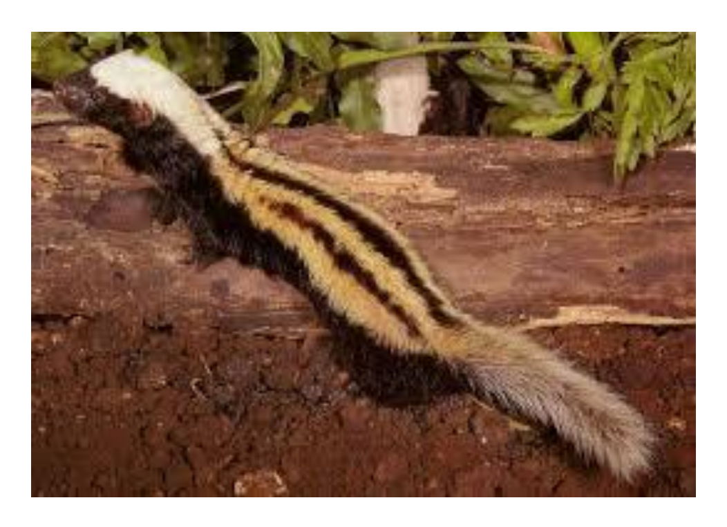
African Striped Weasel or White-naped Weasel (Poecilogale albinuca)