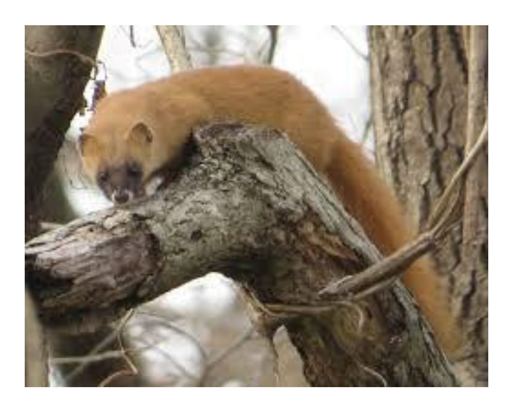
Japanese Weasel (Mustela itatsi)

Range: Japan and adjacent islands (IUCN)