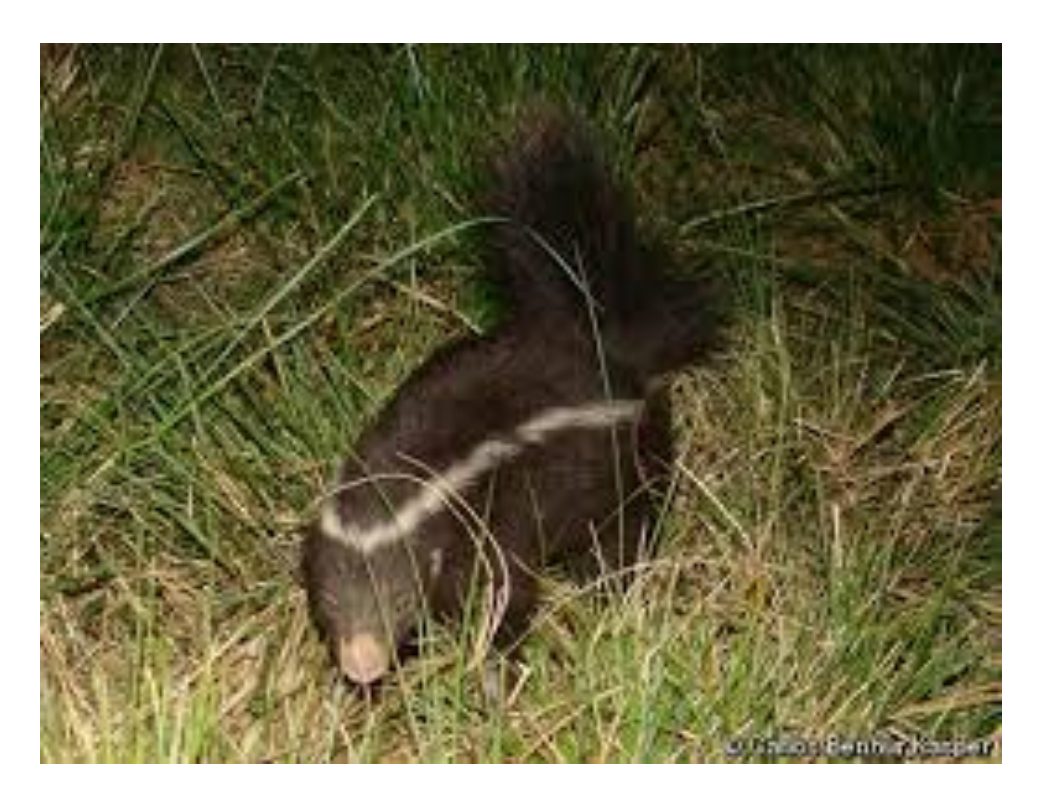
Molina's Hog-nosed Skunk (Conepatus chinga)

Range: "Central and southern Peru, Bolivia, southern Brazil, Chile, northern and western Argentina, Uruguay;" (Nowak, 2005)