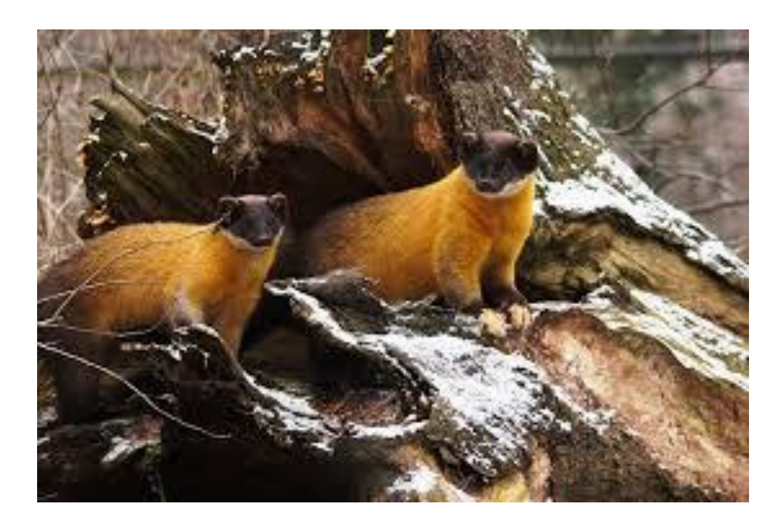
Yellow-throated Marten (Martes flavigula)

Range: "...occurs in South, South-east and East Asia, from Afghanistan and Pakistan in the west, along the Himalaya and foothills east to southern China, throughout mainland South-east Asia, and the islands of Sumatra, Java and Borneo, It also extends north through eastern China (including Taiwan) and Korea to the Russian Far East In Bangladesh it occurs in the North-east and South-east." (IUCN) Size: 370-650mm x 2000-6000g (Nowak, 2005)