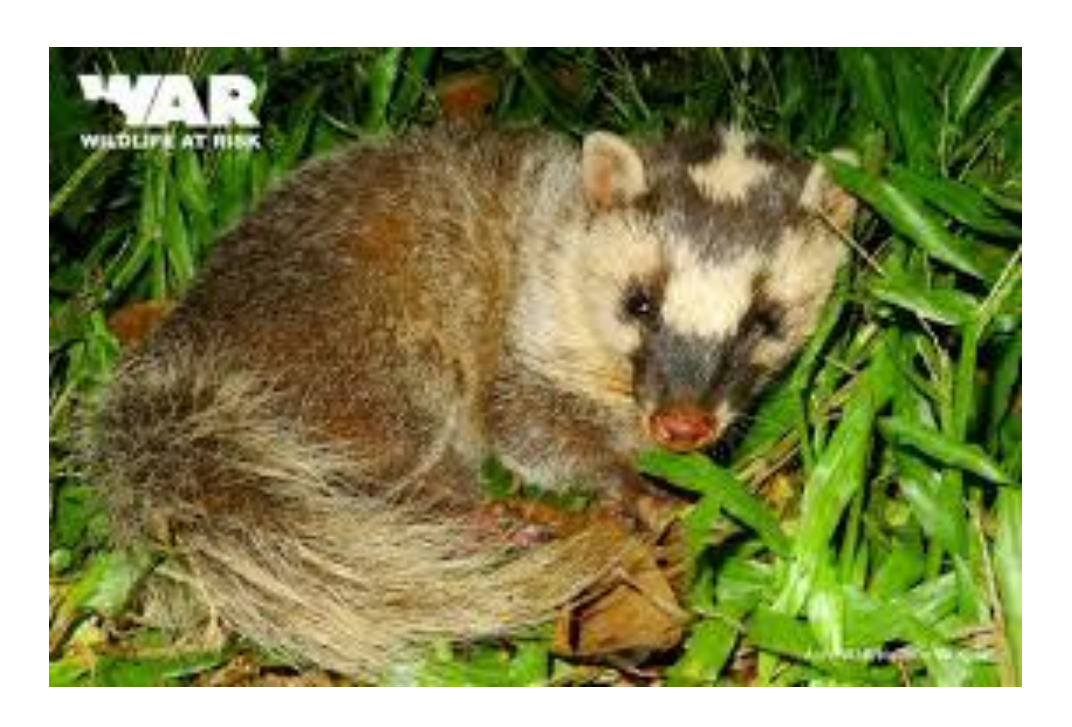
Large Toothed or Burmese Ferret badger (Melogale personata)