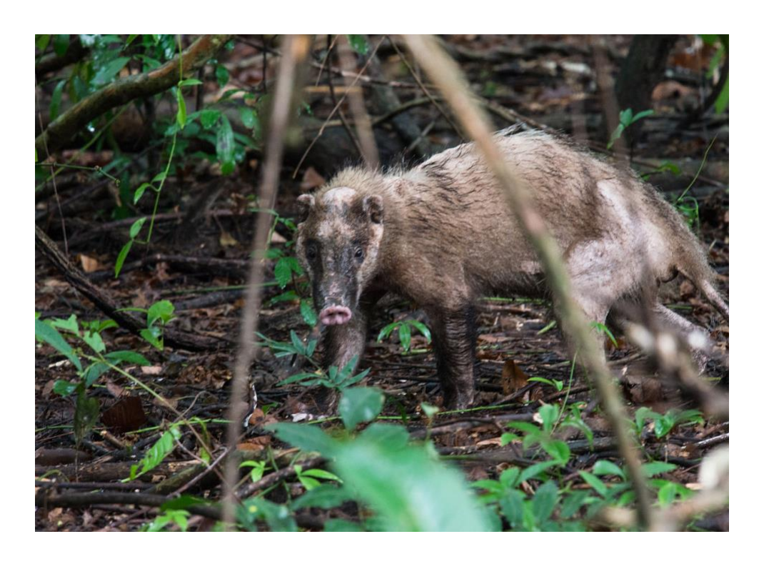
Greater Hog Badger (Arctonyx collaris)

Range: "SE Asia, from E. India, extreme S China, Myanmar and Thailand to Indochina." (Hunter, 2011)