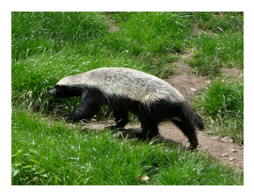
Honey Badger or Ratel (Mellivora capensis)

Range: "The Honey Badger has an extensive range which extends through most of sub-Saharan Africa from the Western Cape, South Africa, to southern Morocco and south-western Algeria, and outside Africa through Arabia, Iran and western Asia to Middle Asia (Turkmenistan, Uzbekistan), the Indian peninsula and Nepal." (IUCN)