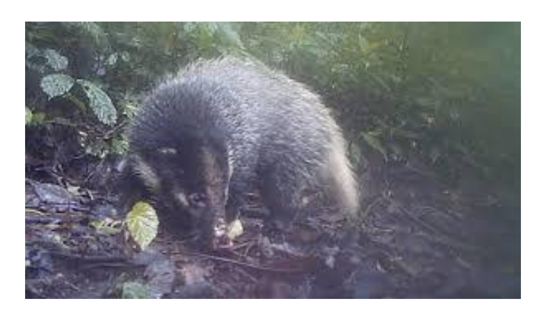
Sumatran Hog Badger (Arctonyx hoeveii)