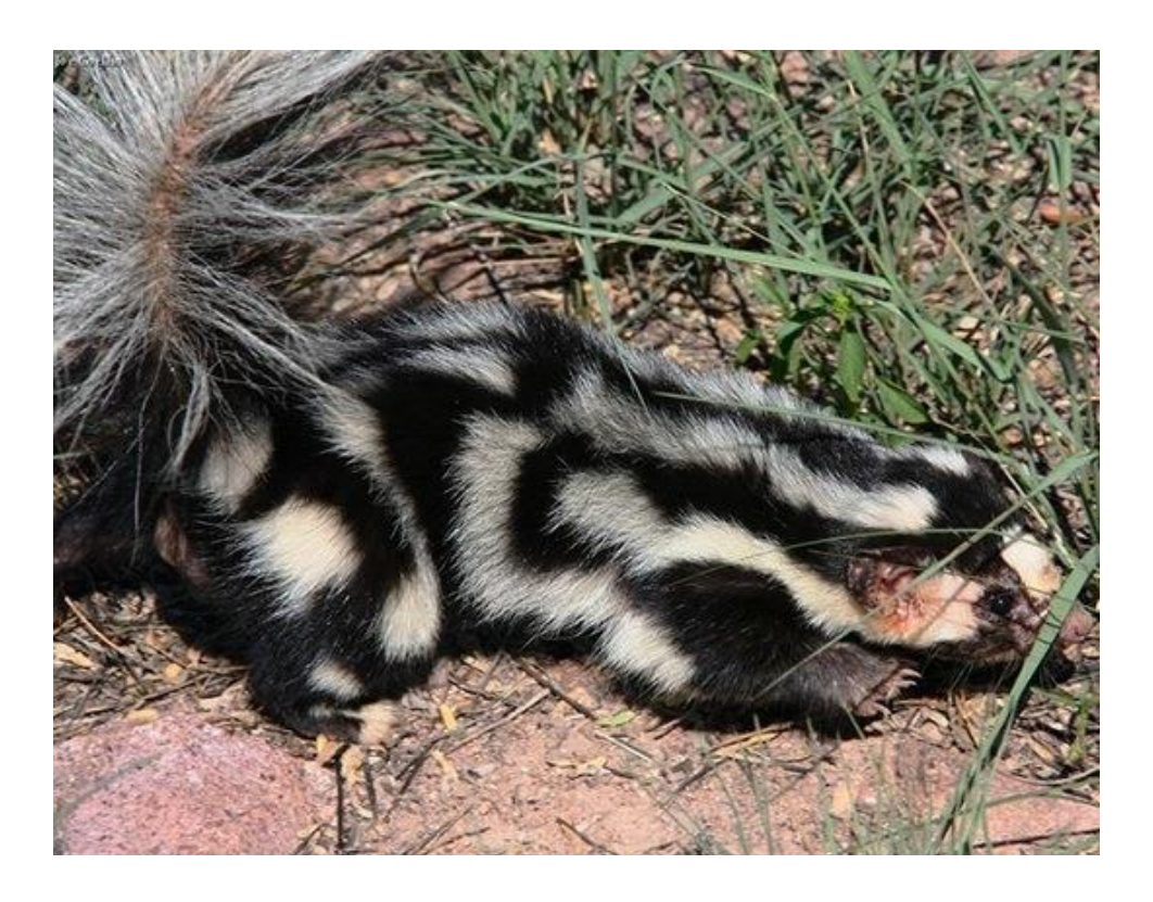
Eastern Spotted Skunk (Spilogale putorius)

Range : The eastern spotted skunk extends east from the Mississippi river though Louisiana and northward to the Ohio river and then eastward to the western edges of the southern coastal states along the Atlantic and on into most of Florida.