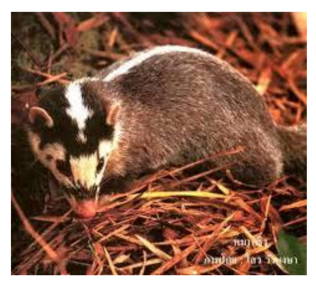
Small-toothed or Chinese Ferret-badger (Melogale moschata)

Range: South and central China, Taiwan, northern Myanmar, northern India and northern Indochina.