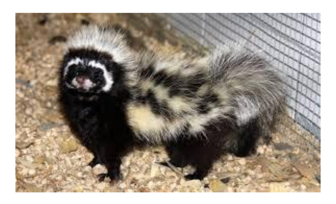
Libyan Weasel (Ictonyx libycus)

Range: "Algeria; Burkina Faso; Chad; Egypt; Eritrea; Libya; Mali; Mauritania; Morocco; Niger; Nigeria;