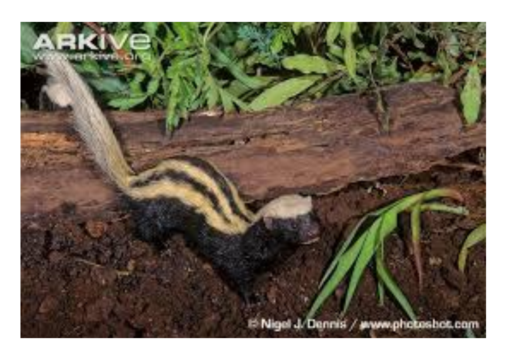
African Striped Weasel (Poecilogale albinucha)

Range: "Sub-equatorial Africa, from S. Kenya and S. Uganda to coastal DR Congo, and south to S.