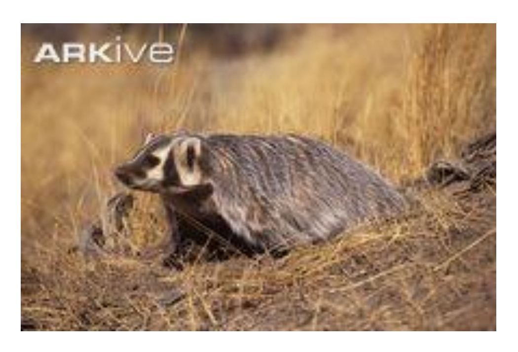
American Badger (Taxidea taxus)

Range: "The species is distributed from southern Canada (British Columbia, Alberta, Saskatchewan, Manitoba, and southern Ontario), over most of the northern, western and central United States, and south to Puebla and Baja California, Mexico." (IUCN)