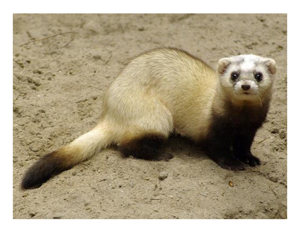
Steppe Polecat (Mustela eversmanii)

Range : "...occurs east from Poland, the Czech Republic and Austria (central Europe) through southern Russia, northern Georgia, Kazakhstan, Turkmenistan, Uzbekistan, Tajikistan, and Kyrgyzstan to Mongolia and northern and western China." (IUCN)