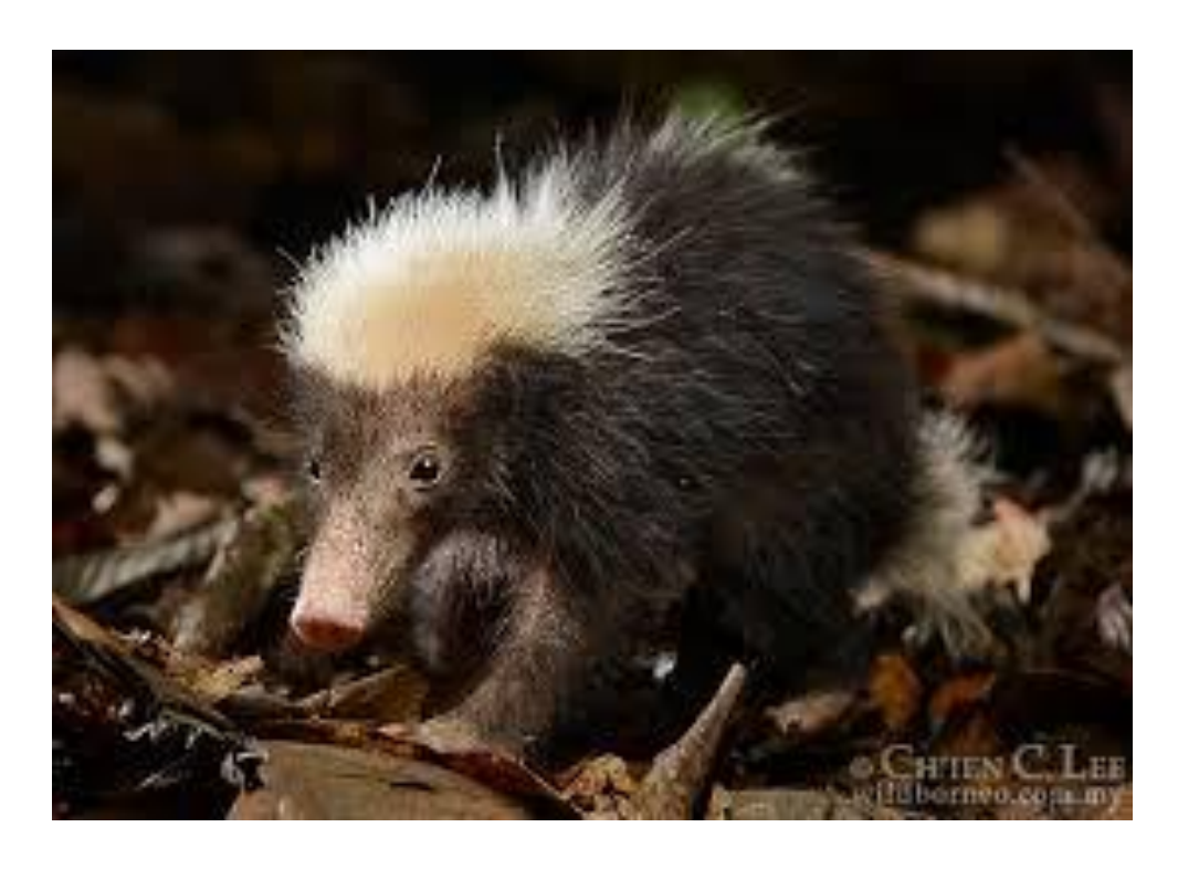
Sunda, Malaysian, or Java Stink Badger (Mydaus javanensis)

Stink badgers are not badgers but, Old World relatives of the skunks found in the New World.