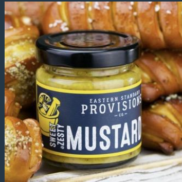
Sweet & Zesty Mustard