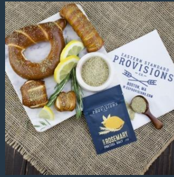
Lemon Rosemary Salt