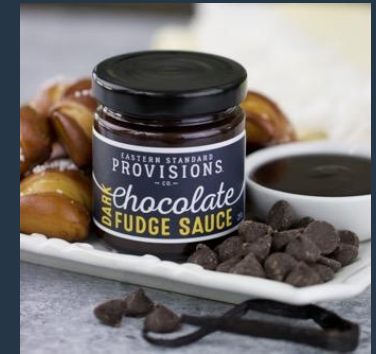
Dark Chocolate Fudge Sauce