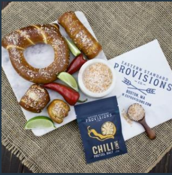
Chili Lime Salt