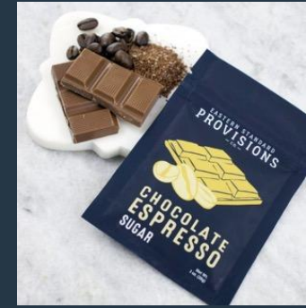
Chocolate Espresso Sugar