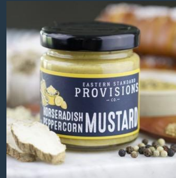
Horseradish Peppercorn Mustard