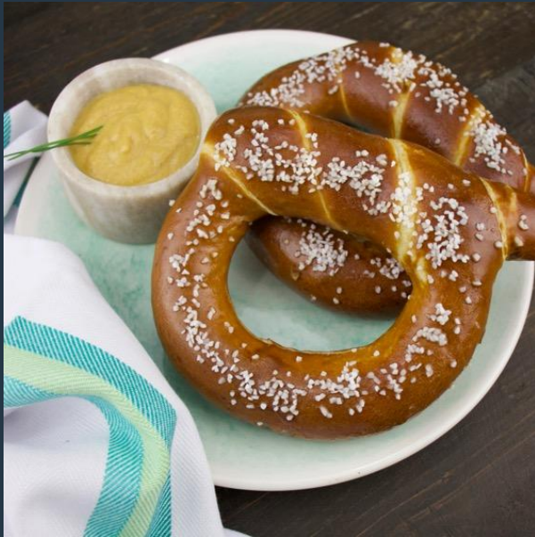
Wheelhouse Signature Soft Pretzels

One-of-a-kind, artisanal soft pretzels that deliver the light, airy qualities of a brioche inside and the traditional Bavarian-style pretzel crust outside