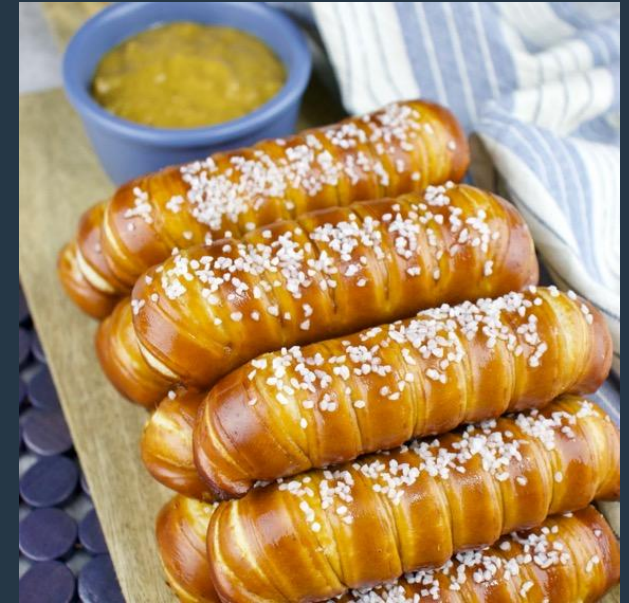
Turnbuckle Soft Pretzel Sticks