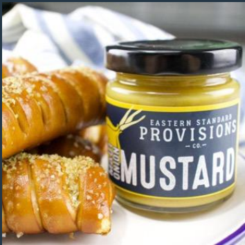
Maui Onion Mustard