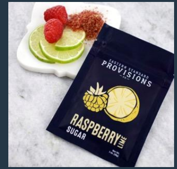
Raspberry Lime Sugar