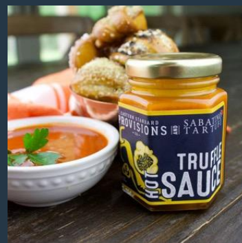
Truffle Hot Sauce