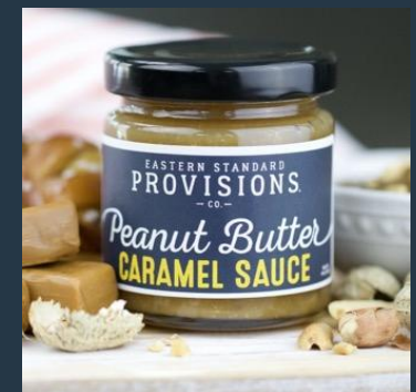
Peanut Butter Caramel Sauce