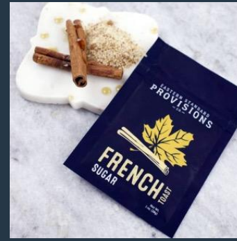
French Toast Sugar