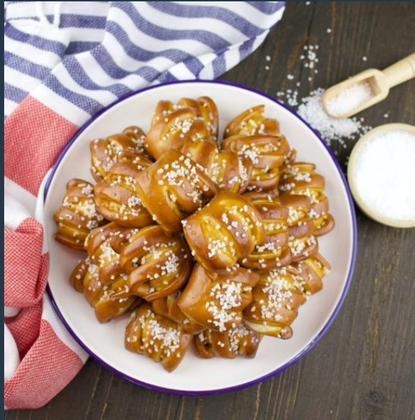
One Timer Soft Pretzel Bites