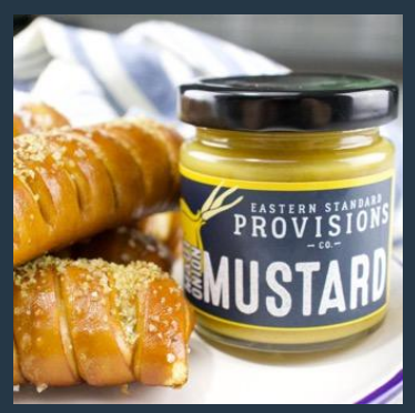
Maui Onion Mustard