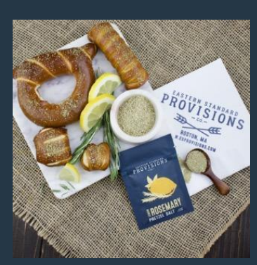
Lemon Rosemary Salt