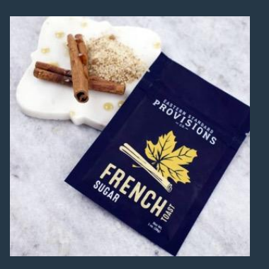
French Toast Sugar