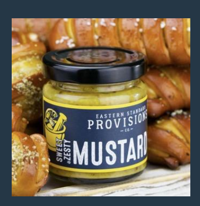
Sweet & Zesty Mustard