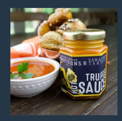
Truffle Hot Sauce