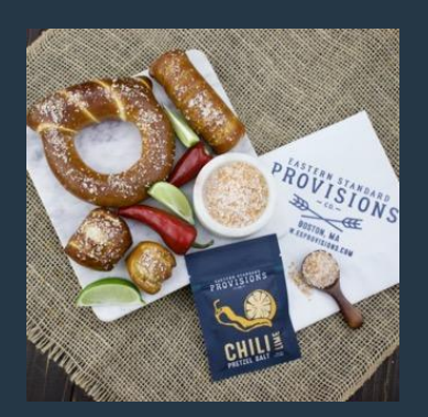
Chili Lime Salt