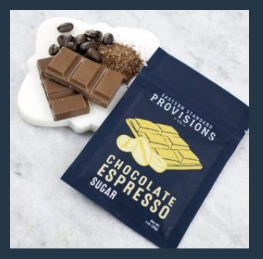
Chocolate Espresso Sugar