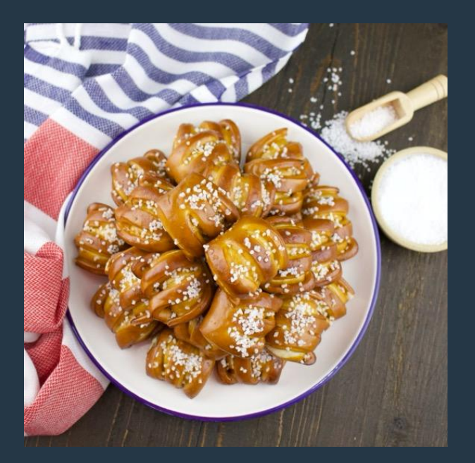
One Timer Soft Pretzel Bites