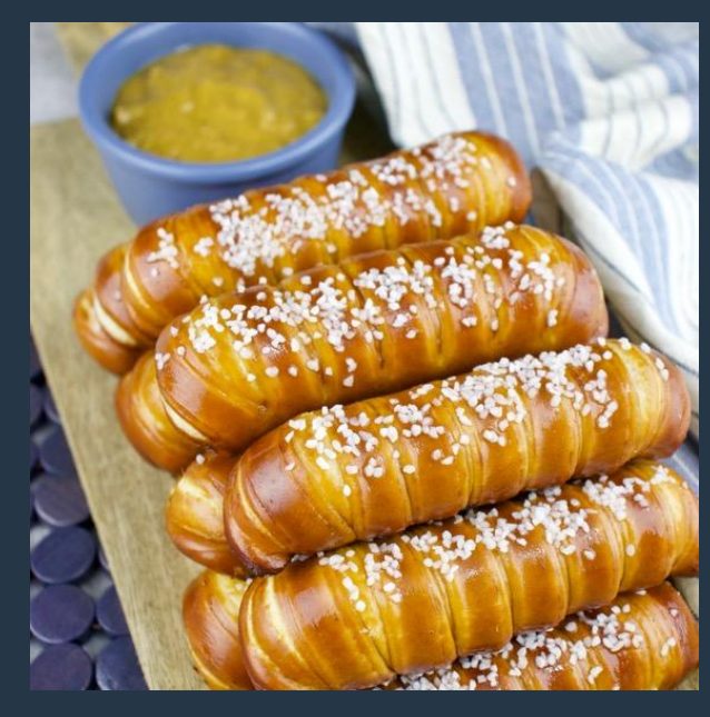
Turnbuckle Soft Pretzel Sticks