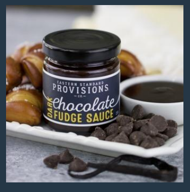
Dark Chocolate Fudge Sauce