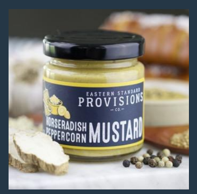
Horseradish Peppercorn Mustard