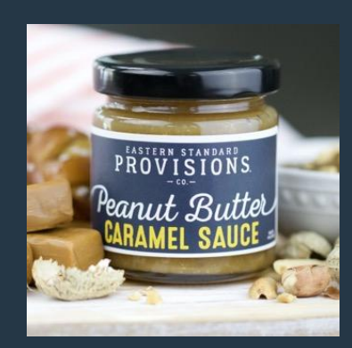
Peanut Butter Caramel Sauce