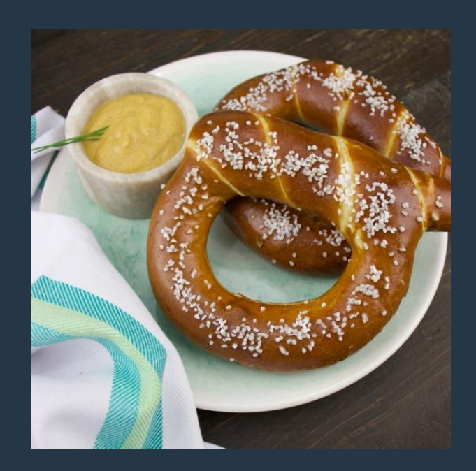
Wheelhouse Signature Soft Pretzels

One-of-a-kind, artisanal soft pretzels that deliver the light, airy qualities of a brioche inside and the traditional Bavarian-style pretzel crust outside