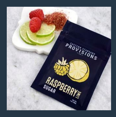
Raspberry Lime Sugar