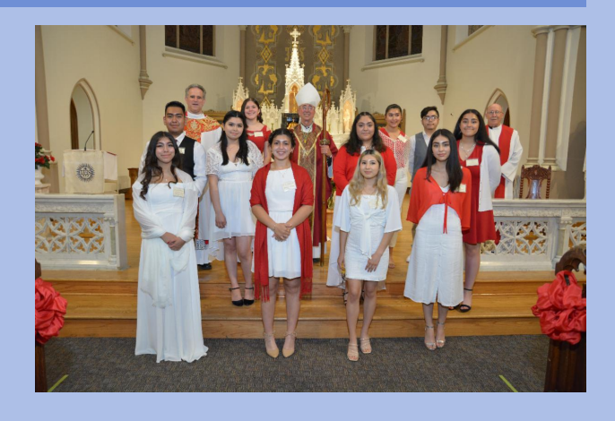
Here I am, Lord. I come to do your will.