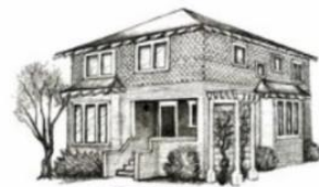
The Churchill House