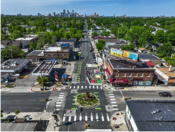
An aerial view shows a memorial area in honor of George Floyd on Thursday in Minneapolis.