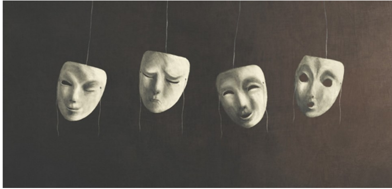
(Illustration: francescoch / iStock / Getty)

Nothing seems to boil the blood of Jesus quite like the behavior of hypocrites. That's my take from the biblical evidence. Other