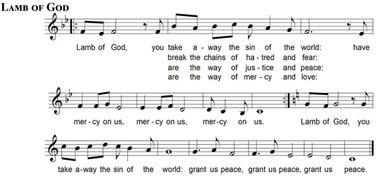
Marty Haugen. Copyright © 1990 by GIA Publications. UBP OneLicense.Net #A-707486.