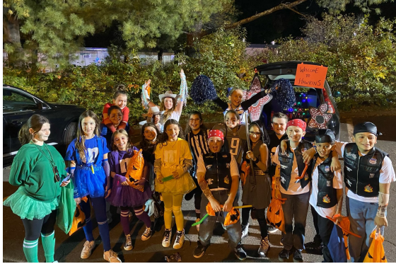
Trunk or Treat