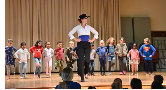
Hispanic Cultural Arts Program