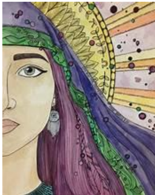
The Story of Lydia