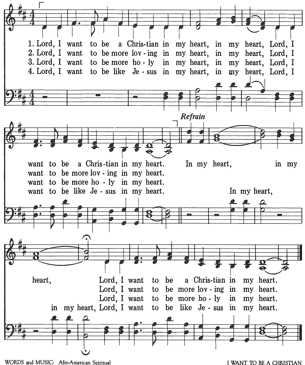
IT BE A CHAISTIAN