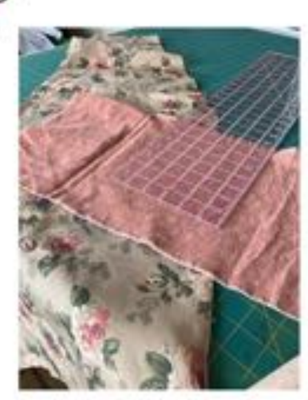
Learn to sew garments with Tracy Franke owner of Ritual Designs

Want to move forward with sewing clothes? Bring your own sewing machine for a three part workshop on how to prepare and select fabrics, interpret commercial sewing patterns, cutting layouts and more. Also, make this nifty utility apron for your garden, kitchen, or workshop