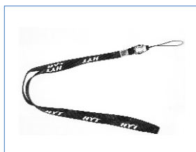
RO01— Hand Strap