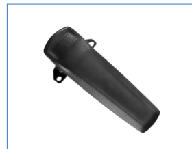
BC08— Belt Clip