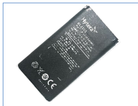
BL3101— Li-ion Battery