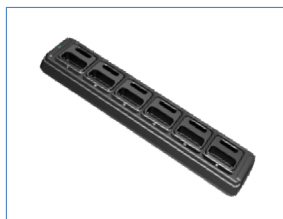
MCL23— Multi-unit Charger