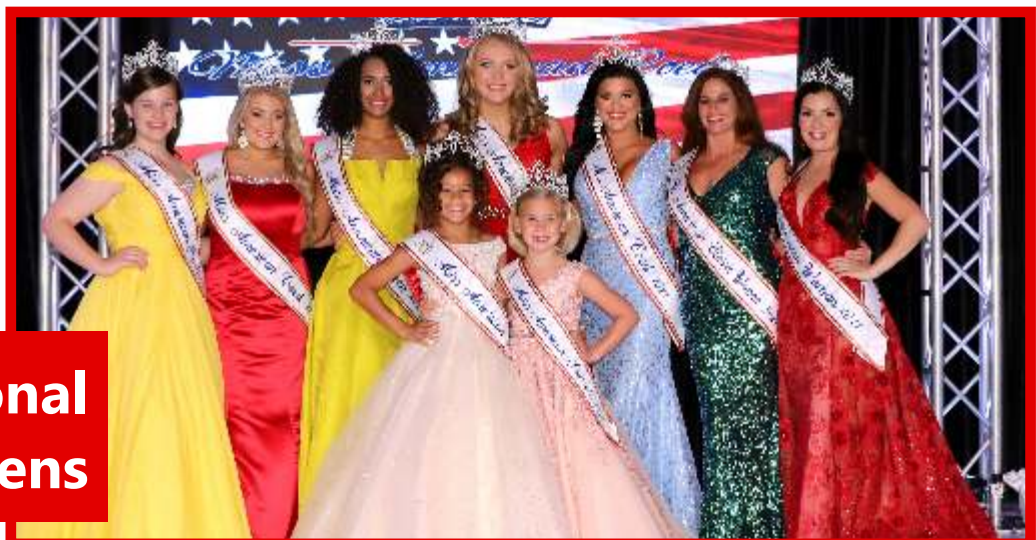
2021 National Queens