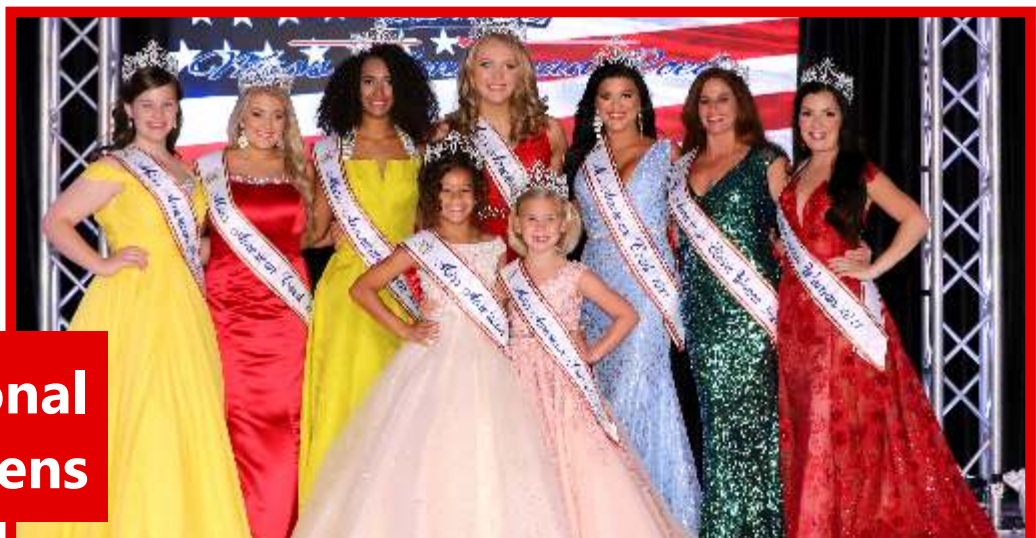
2021 National Queens