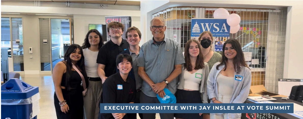
EXECUTIVE COMMITTEE WITH JAY INSLEE AT VOTE SUMMIT