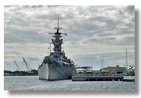
Pearl Harbor - Arizona Memorial