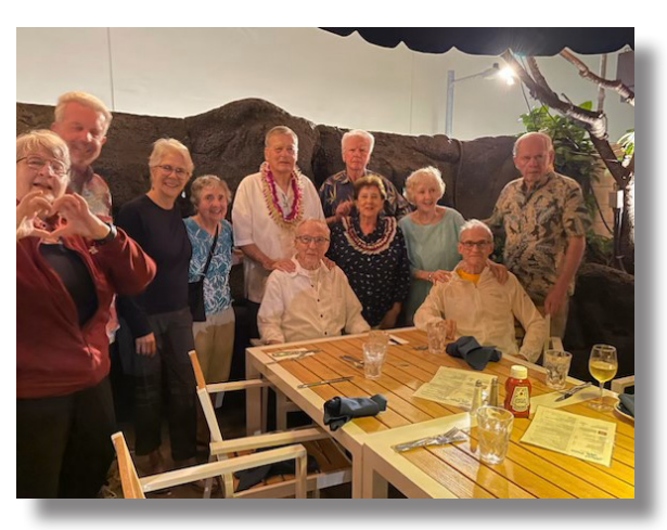
The group enjoying the Hawaiian Luau