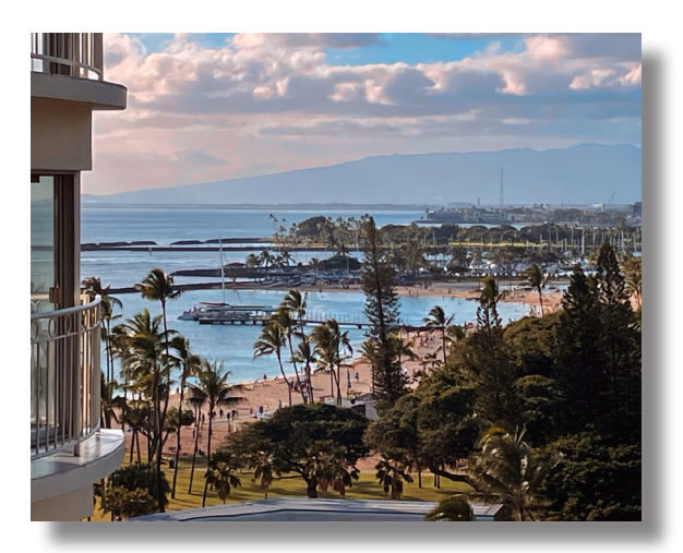
The view from the hotel