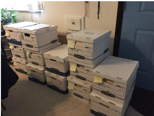
YMCA Historical material to go to State Historical Society of Missouri

see what was already stored from our YMCAs as well as see what I could do to help preserve the history. Additionally, I worked with the Y USA Archivist who also maintains the Archives for Y's Men International. Some of the information for St Louis needed to also be preserved in the Archives in Minneapolis.