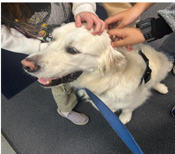
Ever popular "Calvin" visiting school children in the Fresno area.