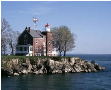
Put-In-Bay's South Shore Lighthouse

Reservations need to be received by September 1st.