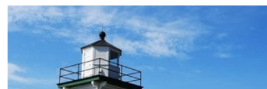
Port Clinton Lighthouse