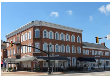
Island House Hotel

Hope you can join us for a fun filled three days.