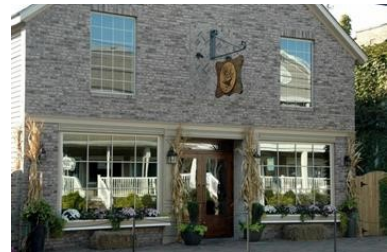
The Forge Restaurant