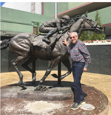
Statute of Triple Crown winner American Pharoah