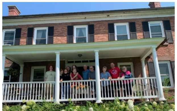
The “Homestead” built in 1825!