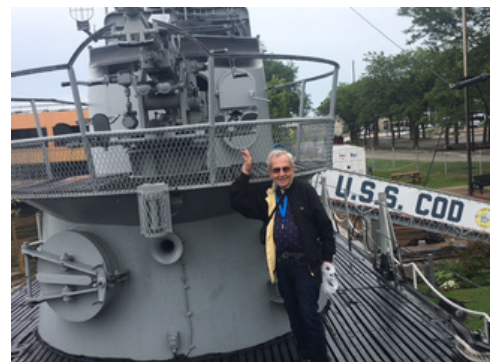
USS Cod in Cleveland