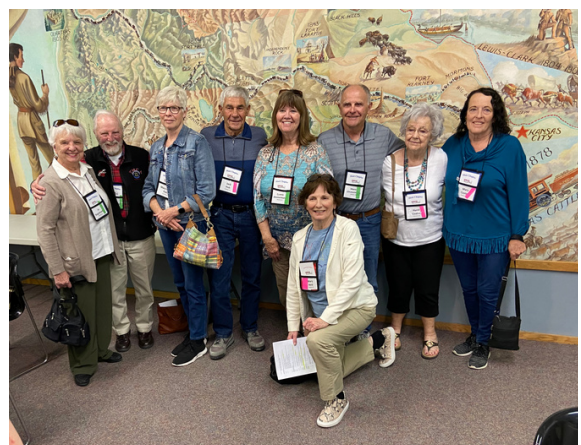
The Mott Chapter at National Frontier Trails Museum