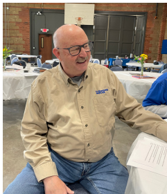
Charlie Redmond took many of our photos