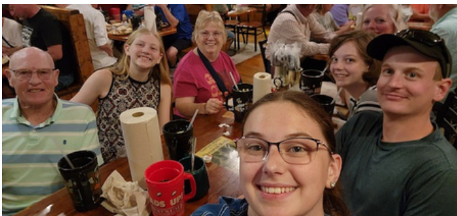
YES! They really do throw rolls @Lamberts Cafe!