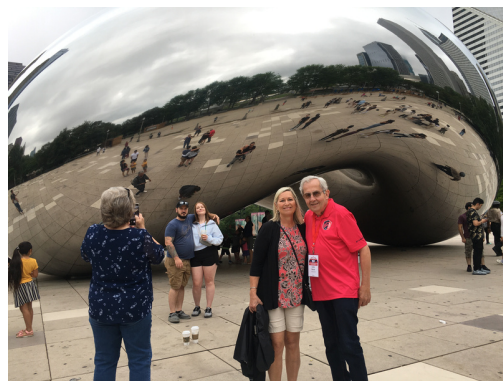
Cloud Gate, otherwise known as "The Bean", in Chicago