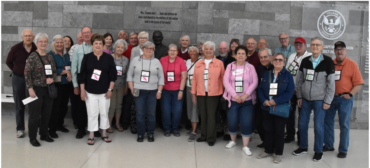
At Harry S Truman Library & Museum