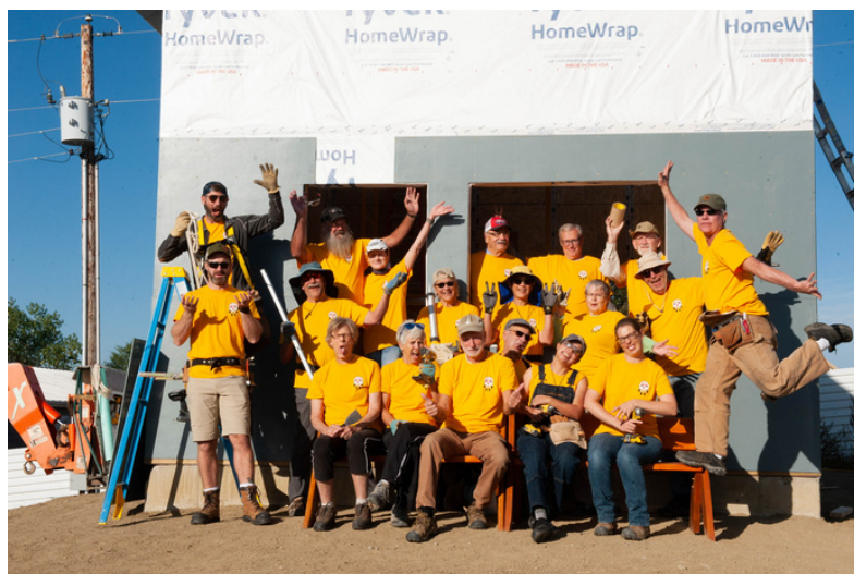
Wave 7