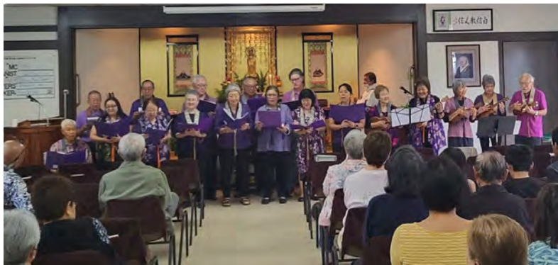
Mililani Hongwanji Choir