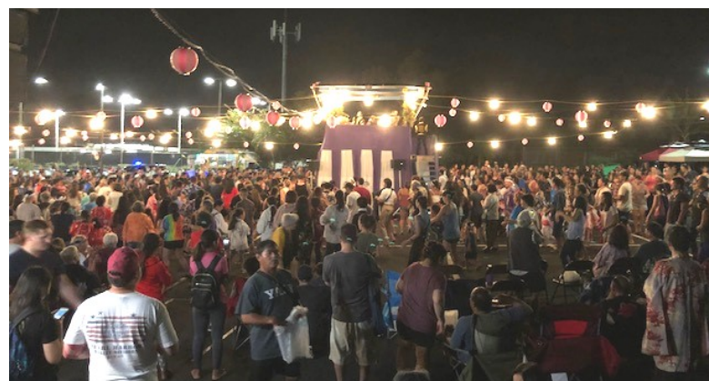
One of our popular Bon Dance in a previous year.