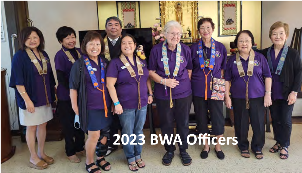
2023 BWA Officers