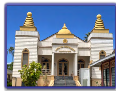
Lahaina Hongwanji Temple