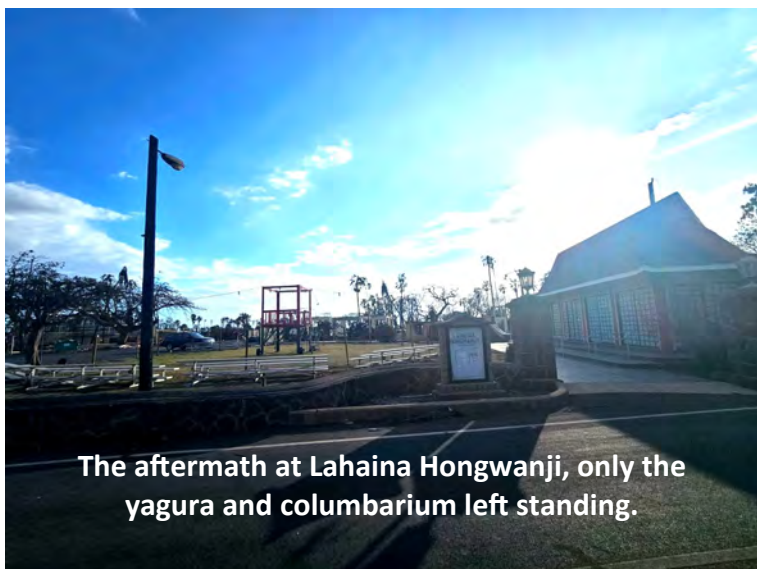
The aftermath at Lahaina Hongwanji, only the yagura and columbarium left standing.

As of this writing, it has been a more than a week since the devastating wildfire ripped through the town of Lāhainā. Our thoughts go to all who have lost their homes, businesses, places of worship, those who have lost loved ones, and their community. I am at a lost for words as I see, hear, and read the latest ongoing, as more information is being relayed.