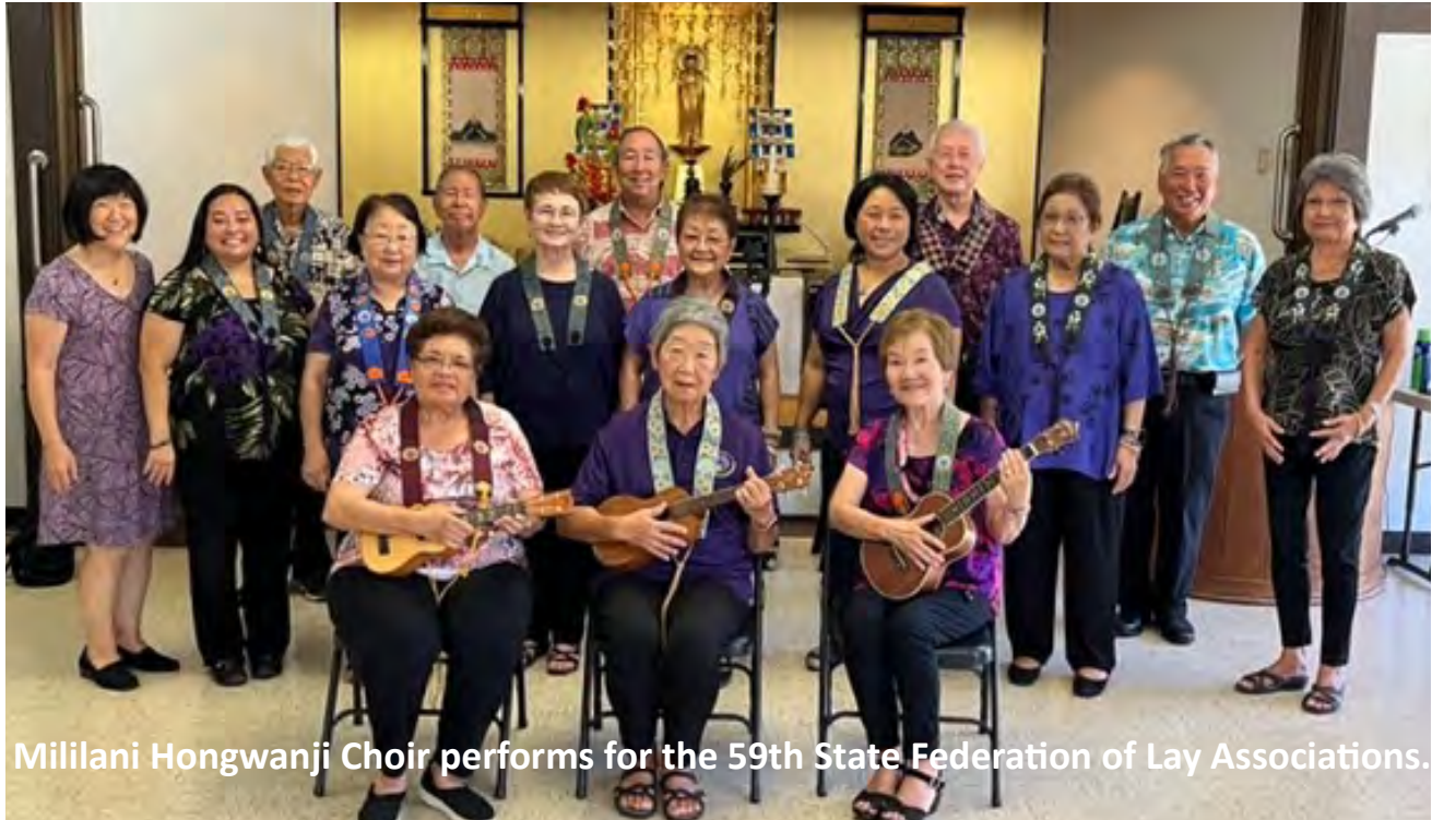
Miliani Hongwanji Choir performs for the 59th State Federation of Lay Associations.