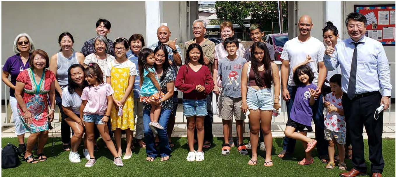
Dharma School Visit to Jikoen Hongwanji in Kalihi