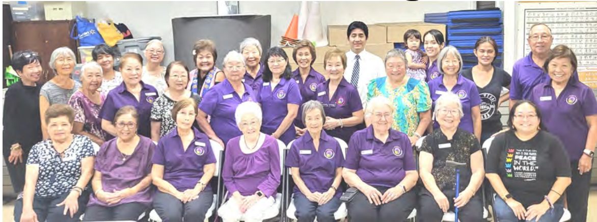
Mililani Hongwanji BWA