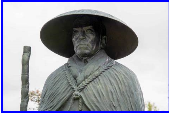
Gotan-e: Saint Shinran's Birthday