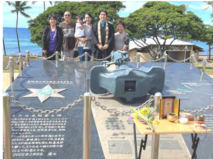
Ehime Maru Cleaning