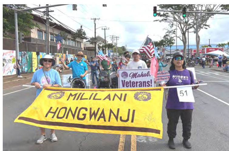
Veteran's Day Parade